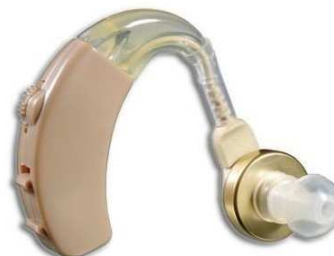
Figure 1. GN ReSound Aventa software for programming HAs (left). Note the complexity of the programming environment and of the various calibration options, as opposed to the two simple controls/settings on a basic analogue HA (right).

Traditional gaming technologies have been successfully employed in non-leisure scenarios for learning and skill acquisition, empowerment and social inclusion [1][2]. Studies have shown that games have benefits for enabling familiarisation of products specifically for older users [3]. Dryburgh [4] notes that the use of technology is self-taught by either watching others, asking advice from others, trial and error, or reading the manual. For many people none of these methods are satisfactory, especially when it is hard to develop a mental model of how a particular device works. Darzentas et al. [5] describe how a game-based approach can be applied to the process of device familiarisation to provide motivation and reduce anxiety and uncertainty associated with the use of technology. Further, digital games have largely done away with manuals, with the familiarisation process now built into the gameplay [6].