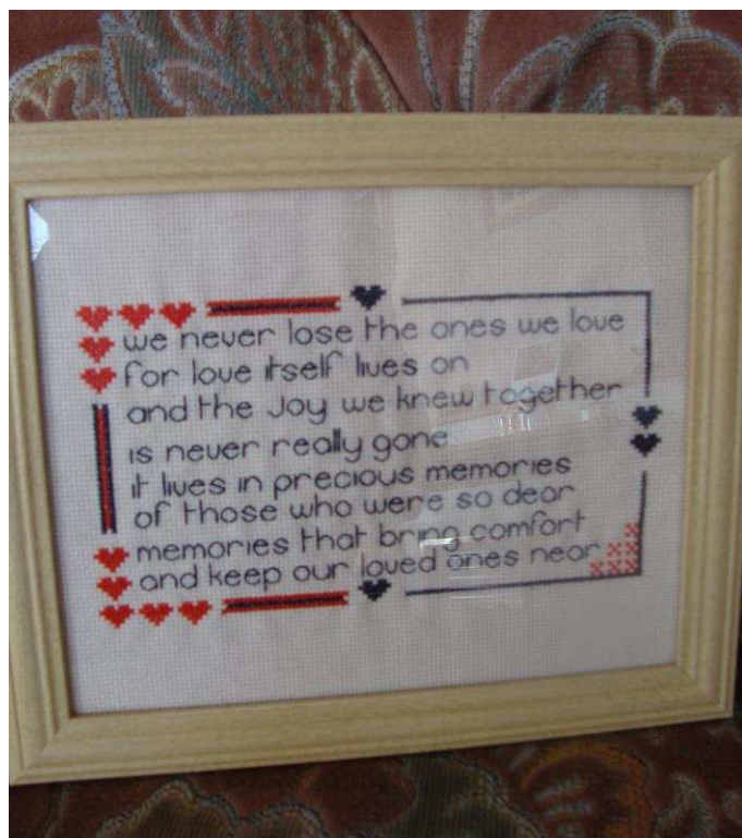
Fig 3: Cross-stitch made for Peggy by her daughter after the death of her husband