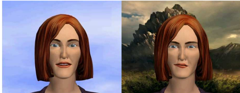
Fig. 2. First (Left) and Second (Right) Version of Background