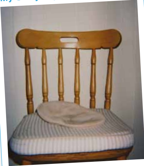
My Story: My father's cap

The cap he used to wear when sitting in the sun. He loved the sun. I used to like to see him sitting in the sun, things looked normal.