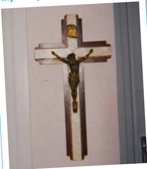
My Story: My father's crucifix

The crucifix outside his bedroom. He used to kiss it every time he passed it, no matter how many times he got up in the night .