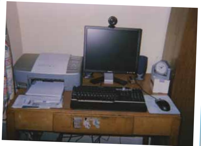
My Story: My desk

This is where I have had to take responsibility for financial affairs. I also have to make all decisions regarding the care of the house and garden which my husband did previously with some assistance from me.