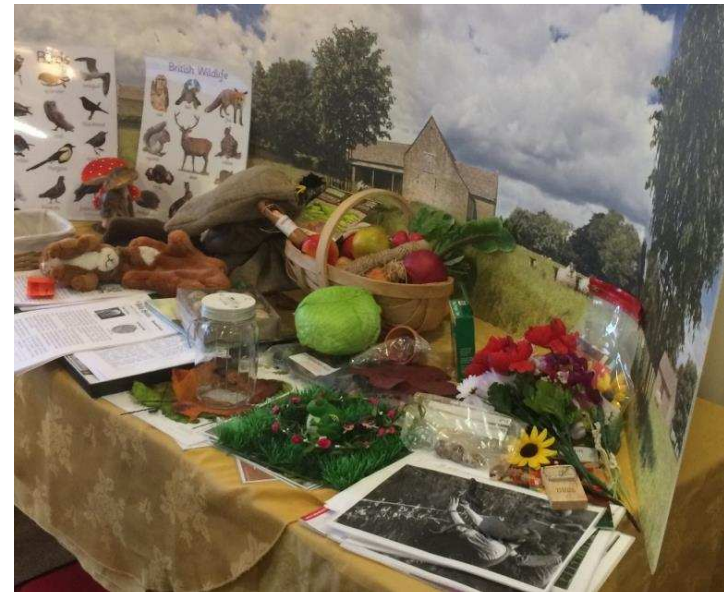
Photograph of one of the memory boxes on display in a care home