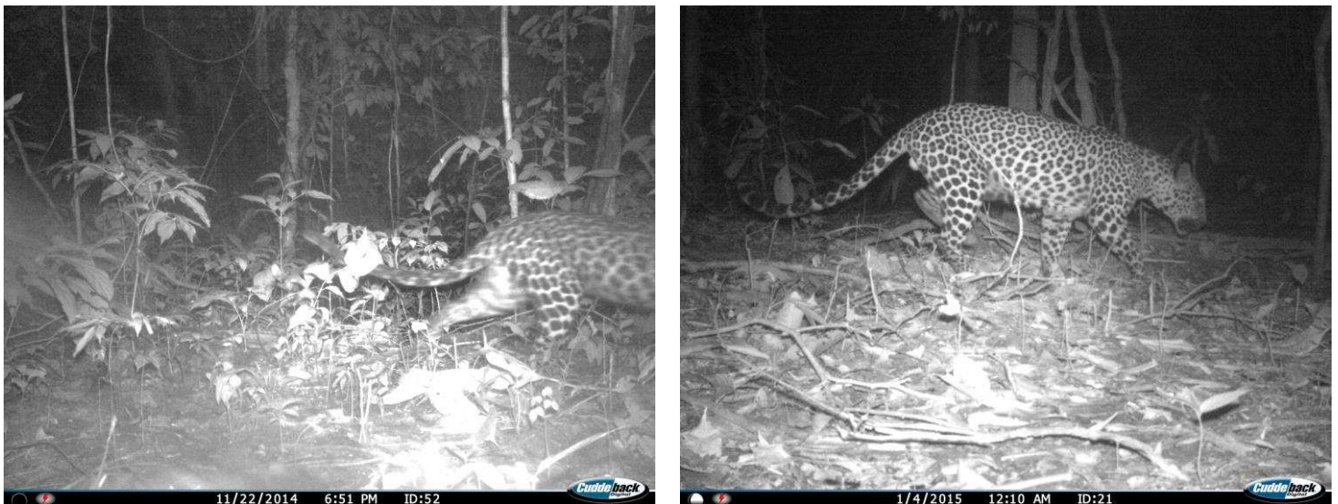
Fig. 3. Trap photos of one possible female (left) and one male (right) spotted leopard.

The spotted leopard is rare in Peninsular Malaysia – so far it has been reported only in two other written works: one in Endau Rompin National Park, in the southern state of Johor [8]; and the other mentioned anecdotally (in an old identification book) as being outnumbered by 'conventionally colored leopards' in Malaya [9]. This is despite the extensive camera trapping efforts in Peninsular Malaysia, all of which (with the exception of the above two studies) have recorded the presence of only the melanistic form [6, 10-15]. A study in 2010 examined the frequency of leopard melanism in 22 locations in Peninsular Malaysia and southern Thailand [5] (Fig. 2). Out of 42,565 trap-nights, 445 photos of melanistic leopards and 29 photos of the spotted morph were collected; all photos of the spotted leopard were taken from study areas north of the Isthmus of Kra, which is the narrow neck of southern Myanmar and Thailand and a well-known zoogeographical boundary [16]. We also added data from five studies since 2010 on figure 1. All these suggest that spotted leopards are at the very least rare in Peninsular Malaysia.