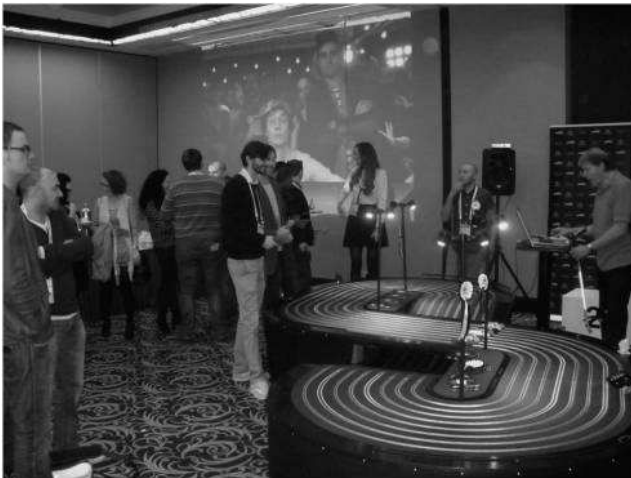
Plate 1. “Expressing competition through Scalextric, Promax UK, 2012”