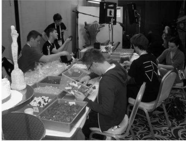
Plate 2. “Expressing creativity through Lego, Promax UK, 2012”

marketing and promotion as distinctly uncreative sectors of the cultural industries. For instance, media scholars like Georgina Born (2004) have argued that the introduction of marketing to the BBC in the 1990s offered a threat to creativity, particularly when used “to batten down and curtail the particular and expansive imaginative engagement required by good programme-making” (p. 301). Laments about creative imagination, or its lack thereof, extend to popular representations of television marketing. Also focusing on the BBC, the satirical television comedy WIA (2014) lampoons the brand obsessions of the Corporation in the early 2010s and the inane efforts by marketing and PR consultants to update and “app-ify” the BBC’s logo[4]. Rather than depict promotional work as a professional discipline requiring creative acumen, marketing is seen in these portraits as limiting and vacuous in creative and imaginative terms.