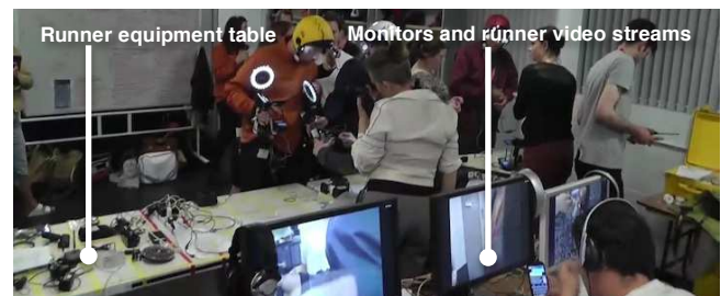
Figure 2: Runners gearing up for the next session

We captured extensive video recordings of the IHY team's activities across the four days. We were primarily based in the game's control room (Figure 2) which provided a gearing-up point for runners before and after the game sessions, housed three live video feed displays for the monitors and stage manager, and space for technical crew to prepare and monitor equipment, including cameras (see below), walkie talkies and mobile phones.