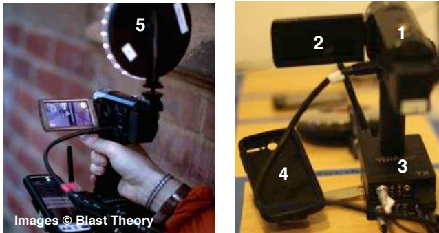
Figure 3: The camera rig; in use (left)

The most central element is the camera rig that is held by the runners (see Figure 3). This consists of three elements: (1) a wide-angle HD handheld camera with (2) a viewfinder, attached to a grip and mount; (3) a Teradek Bond attached to the bottom of the grip’s mount which enables the video from the camera to be demultiplexed for streaming over multiple mobile data network connections (e.g., 3G) and subsequently multiplexed on a server; (4) a mobile phone mounted to the side, permits control of the snapping mechanism (i.e., choosing to make it available to online players) and displays online player text messaging; (5) a light on top of the camera is used both to improve the video but also to enhance the camera rig’s ‘performativity’.