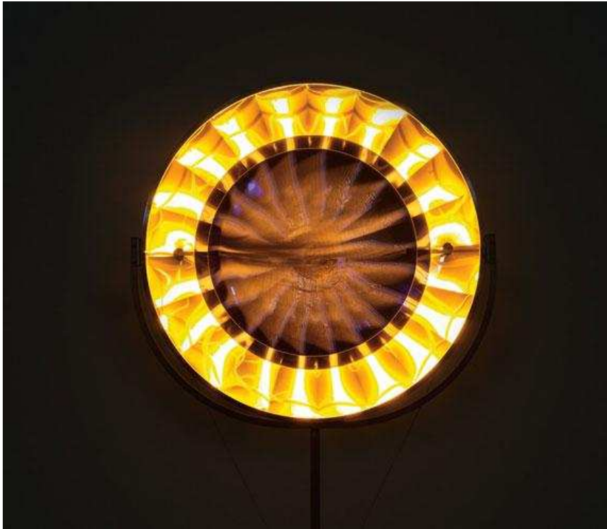
Figure 1: LouisVuitton x Eliasson Eye See You

The emotional and affective charge of the window design is engaging and powerful. By representing the eye, quite literally, we see how this collaboration questions the very nature of the shop window as a space for looking at commodities. In a striking inversion of the gaze, the 350 Louis Vuitton windows display nothing but the illuminated monochromatic pupil of an eye, watching, following, surveilling. The eye-light is so bright that it is difficult to look at and the remainder of the window is shrouded in blackness. In this daring switching of the relationship between viewer and viewed the consumer sees nothing. The eye sees you. The installation, as a metaphorical eye with an indifferent and/or aggressive relationship to moving viewers effectively speaks to a number of conceptual debates about the gaze, the relationship between watcher and watched, consumer and store, surveillance and social control (Modigliani, 2007). The relations between art and fashion provocatively reveal how on the one hand, fashion can “transform places and spaces, adding, deferring or altering the identity of the environment, while, on the other hand, it can increase the cachet and cultural