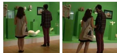
Figure 2: P4.a (left) and P4.b at Singing Gargoyle

During the visit. As they reach the object, P4.b steps forward to stand in front of the object, while P4.a stands a few feet away, giving P4.b space to do the experience alone while orientating herself so that she can see both the object and P4.b. They stay in this position for the duration of the audio with very little movement, seemingly immersed in their own experiences. As the audio finishes, P4.b orientates slightly towards P4.a while he reads the text. P4.a continues to watch P4.b. She laughs nervously while trying to gauge his reaction (instructing P4.b to confront a delicate fear is a somewhat risky strategy that might potentially backfire). P4.b notices and smiles back. P4.a then touches him on the waist, says “Sorry”, and continues to laugh. P4.b says, “It's ok”, smiles and walks away towards the next object.