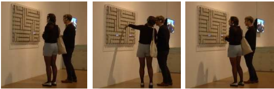
Figure 3: P2.a (left) and P2.b at Aqua-planing