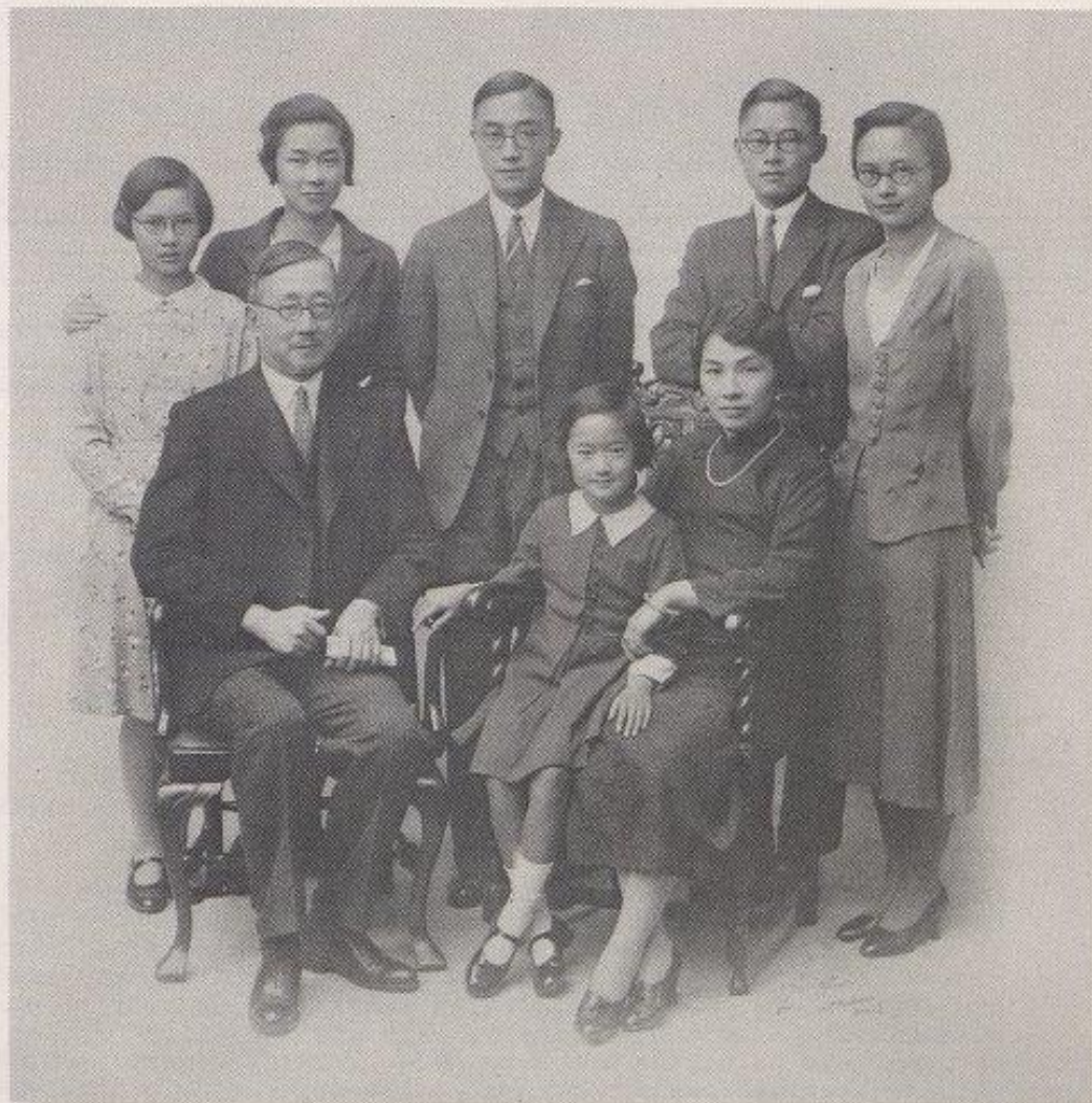
Sze Family, 1932