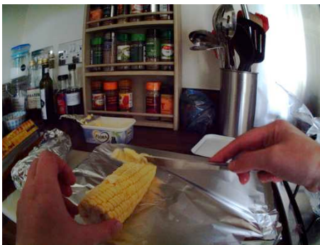
Figure 4 – Food Behaviour: Autographer Image

triggered by people entering the room and network logging was always on.