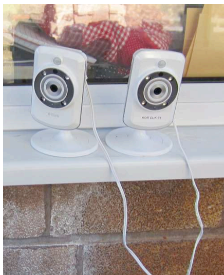
Figure 1 - IP Cameras setup in the household

Researcher time, privacy concerns, and a lack of capacity to reliably capture behaviours of interest mean that many existing studies of home behaviour rely upon self-reporting methods. However these have methodological concerns that could be ameliorated by the development of approaches that capture additional forms of data [1,4]. Both of the methods discussed in this paper primarily focus on visual data capture in the home, which due to its richness can be considered particularly sensitive [6]. Study participants are also likely to have pre-existing understandings and positions towards video surveillance, particularly given the rise of reality TV and 'fly-on-the-wall' documentaries [3].