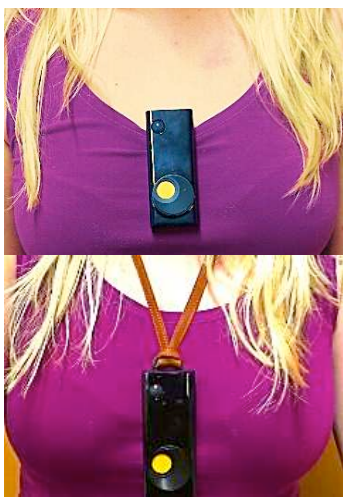
Figure 3 - Autographer clipped on (top) and with a neck strap (bottom). Yellow shutter is closed in both.