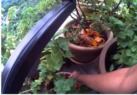
Figure 5 - Example of wider context of food practices. Here a participant is using food waste in their garden.

home, others only felt compelled to wear the camera when cooking and eating. However, the research team were also interested in the wider context of cooking and eating practices, such as exposure to information about food, the use of shopping lists and recipes, or unexpected uses of food waste (Fig 5). Thus some data sets yielded more insights than others.