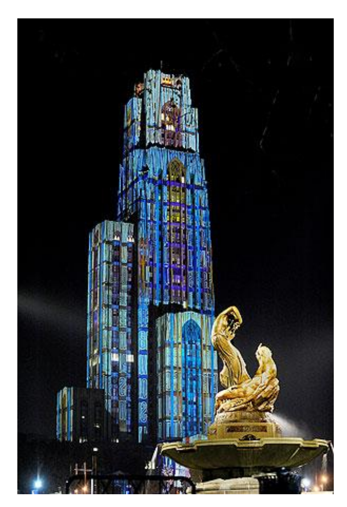
Illuminated Cathedral of Learning 2008, University of Pittsburgh, Innovation Institute