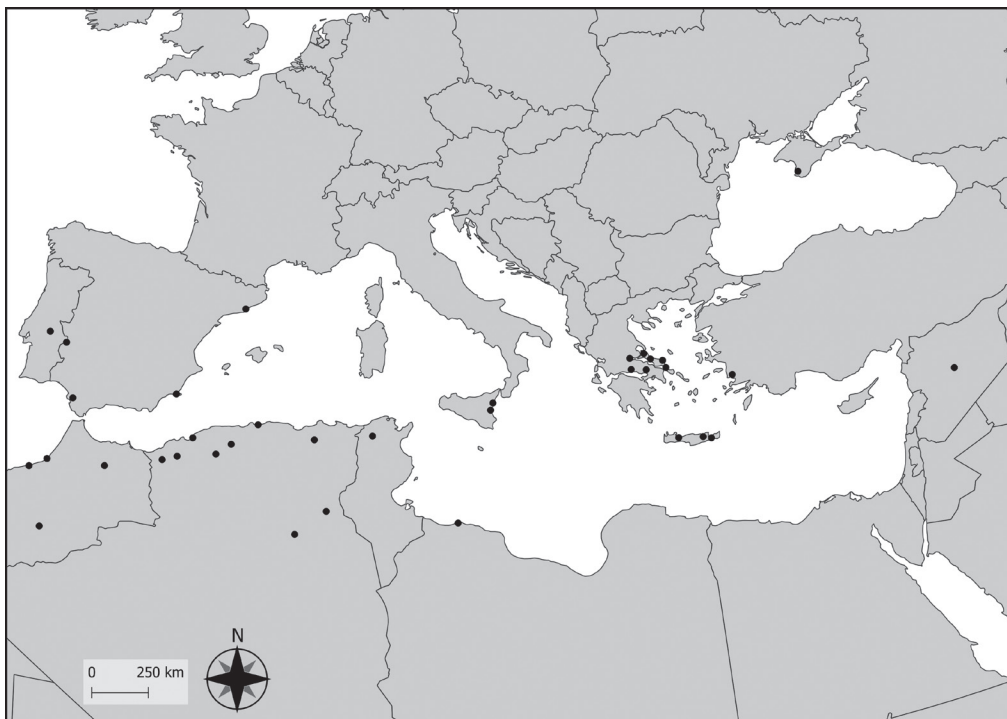
Fig. 2. General distribution map of Poa maroccana from herbarium and literature data.

Crimea: Crimea, near the settlement Frunzenskoe, Tzvelev s. n. (LE), see Nosov et al. (2019).