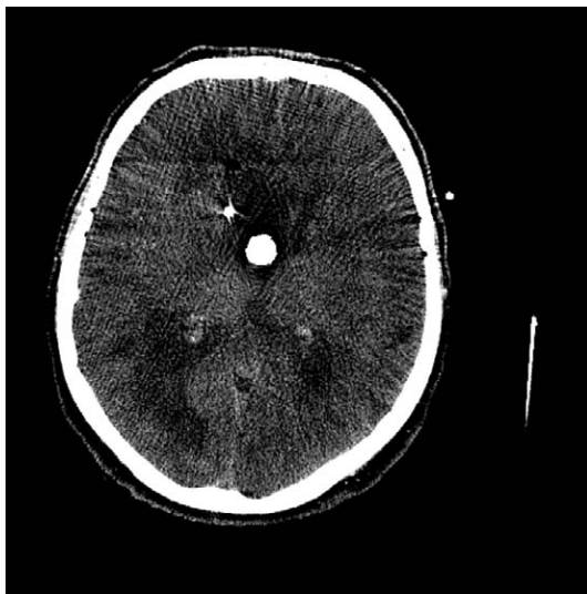
Fig. 6. Dynamic brain axial computed tomography performed immediately after the endovascular procedure, confirming correctly placed external ventricular catheter away from the coiled basilar artery aneurysm fundus.