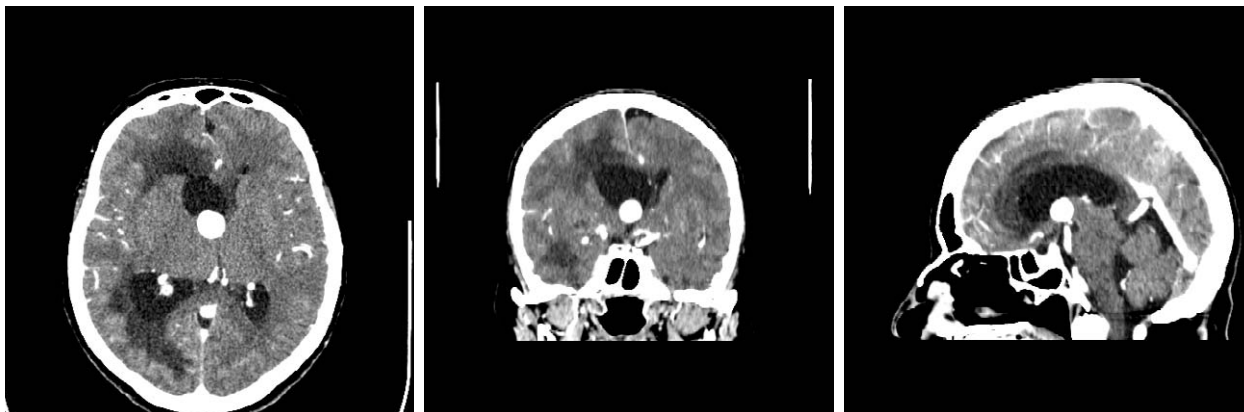
Fig. 2. Magnetic resonance angiography of the cerebral vessels in axial (a), coronal (b), and sagittal reformations (c), identifying the third ventricular mass lesion as a large saccular basilar tip aneurysm measuring 17 mm in diameter.