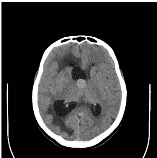
Fig. 1. Axial computed tomography of the brain revealing a hyperdense expansive solid mass in the third ventricle with one-sided dilatation of the right lateral ventricle and periventricular effusion.

Native and contrast-enhanced axial computed tomography (CT) of the brain revealed a hyperdense solid expansive mass at the foramen of Monro of the third ventricle with one-sided dilatation of the right lateral ventricle and periventricular effusion, indicating a hypertensive obstructive unilateral hydrocephalus (Fig. 1). Magnetic resonance angiography (MRA) and supra-selective digital subtraction angiography (DSA) of the cerebral vessels identified the third