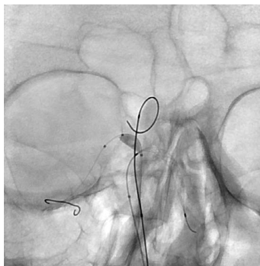
Fig. 4. Cerebral digital subtraction angiography in anterior-posterior projection depicting a balloon sceptor XC catheter placed into P1 segment of the right posterior cerebral artery (PCA) and Comaneci bridging device placed into P1 segment of the left PCA, together with microcatheter in the aneurysmal sac.

The patient was selected for endovascular treatment followed by cerebrospinal fluid (CSF) derivation. After aneurysm coil occlusion and temporary external ventricular drainage (EVD), the symptoms immediately diminished and ventricular dilatation decreased (Fig. 4; Fig. 5a,b; Fig. 6). A modification of the 'gold' standard in the treatment of wide-neck aneurysms with balloon remodeling (firstly described by Moret et al. in 1997) was applied 6 . This relatively novel technique for protecting/remodeling the aneurysm neck and preserving both posterior cerebral arteries (PCA) consists of Y-Comaneci/balloon configuration, which narrows the effective neck and straightens the vascular bifurcation angle 7,8 . Similar technique but with double Comaneci device was described by Sirakov et al. in 2018 9 . A balloon catheter was placed in P1 segment of the right PCA, while a Comaneci bridging device was positioned in P1 segment of the left PCA, thus ensuring both P1 segments to stay open and at least one cerebellar hemisphere to remain constantly/sufficiently blood-supplied, since both the posterior communicating arteries (PComs) were lacking (Fig. 4). Then, a microcatheter was placed in the aneurysmal sac, which was packed with 15 coils (Fig. 5a,b). No additional devices (stents/flow diverters) were used to avoid the need for double antiplatelet therapy.