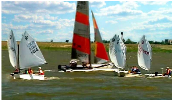
Figure 2 The Budak estuary [12]