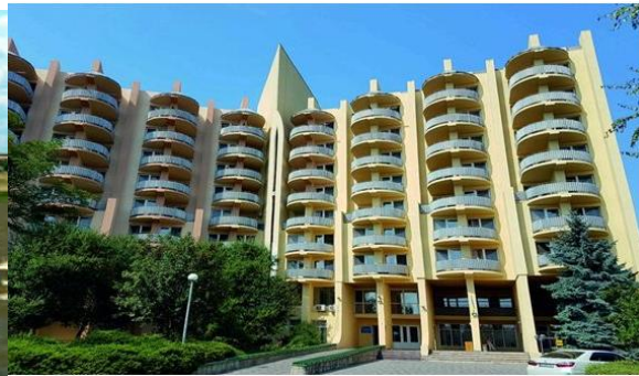
Figure 3 Sanatorium Horizon [13]

In addition to the medical and rehabilitation centers, tourism directions and types, such as historical, sports, ethnic, religious, and festival-based tourisms, are attractive in Sergeevka.