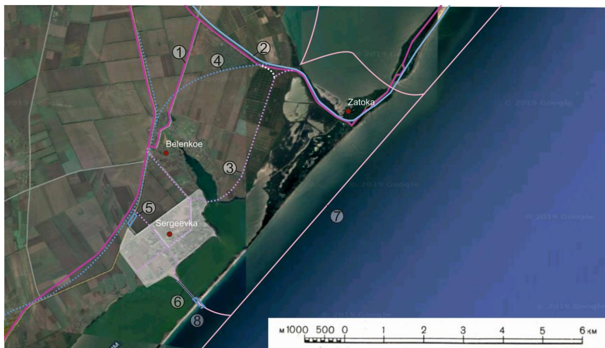
Figure 7 Organizational concept of the transport system of Sergeevka resort: 1) existing highway; 2) existing railway; 3) proposed highway; 4) proposed railway; 5) and transport hub. 6) Renewed pedestrian-transport bridge integrated into the urban transport and pedestrian scheme. 7) Renewable water-transport concept and 8) the proposed seaport with leisure facilities year-round. [20]

The realization of the trans-border transport network (TEN-T) projects in Armenia, Azerbaijan, Belarus, Georgia,