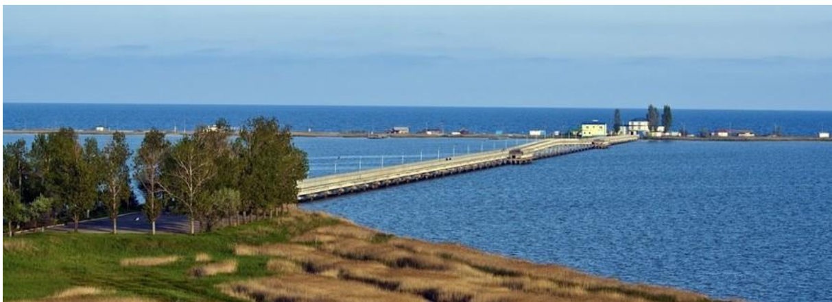
Figure 1 Pedestrian-transport bridge over the Budak estuary [12]

The Budak estuary (length, 17 km; width, 1.5 km; depth, 0.2 – 1 m) is separated from the Black Sea by a narrow (up to 150 m) sandy embankment, which is a beautiful beach used for thalassotherapy. In 1972, the pedestrian-transport bridge that is more than 1-km long was put into operation over the estuary, which connects the mainland with a sea spit. [11] (Figures 1 and 2):