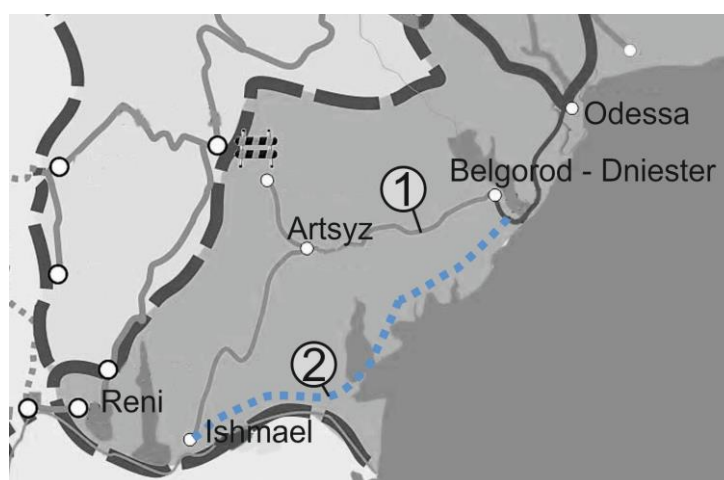
Figure 6 Organizational scheme of Sergeevka railway communitie: 1) existing railway line and 2) proposed railway line along the coastline.

Ukrainian national railway, UZ, has recently presented its five-year development strategy for 2017–21. This includes the formation of five business sectors: freight transport and logistics, passenger transport, infrastructure, traction services, and manufacturing services. The 2017–21 rolling stock investment plan includes the purchase of 212 passenger locos, 35 773 wagons and other. This implies that at least half of the UZ fleet would be new or modernized than the current situation in which three-quarters of the fleet is in need of modernization or replacement [18].