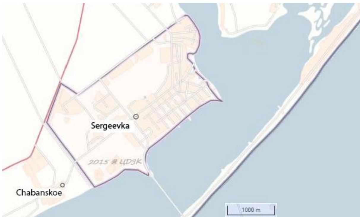
Figure 5 Fragment of the map showing the surroundings of Odessa with the Sergeevka settlement, 2015 [16]

The plans also include the construction of the largest resort and recreation complex in Ukraine, the Lazurny water park, which can accommodate 4000 visits per day with an area of 8 ha, located on the spit between the Budak estuary and the sea [17]. Despite the presence of a health-improving base, field-based research has shown the lack of infrastructure in the resort town: the primary problems that impede the development of Odessa's south