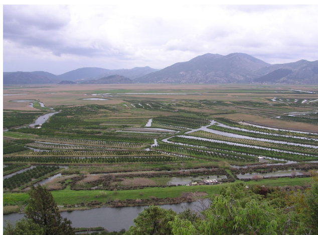
Fig. 2. Citrus orchards in the Lower Neretva Valley.

ety that can be cultivated in all five growing areas is the Satsuma mandarin, whilst the cultivation of lemons, oranges and other citruses is possible only in warmer microclimatic locations such as areas of Dubrovnik, Neretva River Valley and the surroundings of Split including the islands.