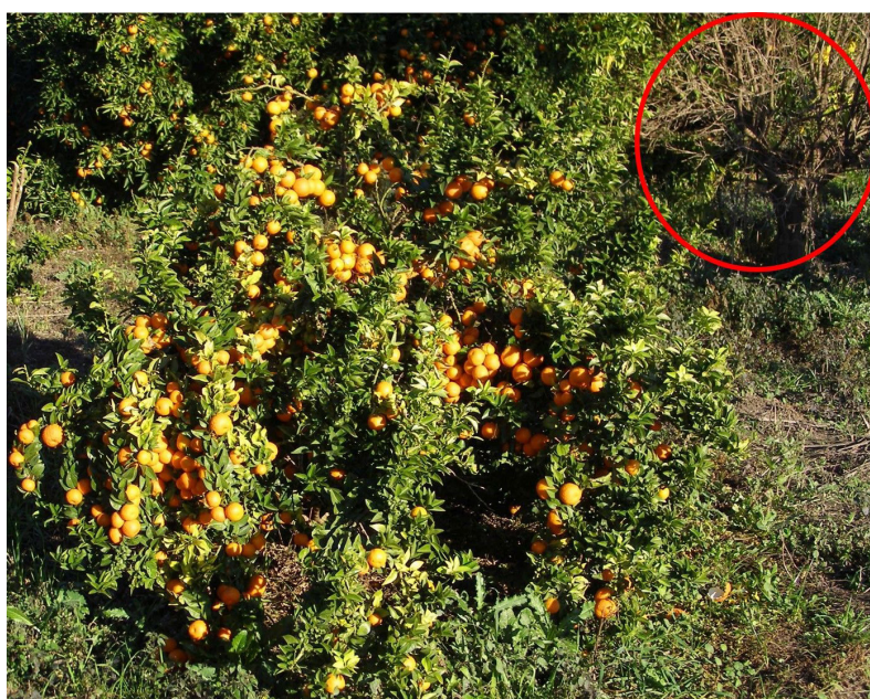
Fig. 3. A fruit bearing tree of local extra-early ripening Satsuma mandarin ( Citrus unshiu Marc.) 'Zorica Rana' in contrast to a quick declining tree (circled).