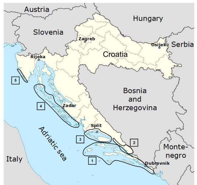
Fig. 1. Citrus growing areas in Croatia (framed numbers). 1 – Dubrovnik area including the islands of Hvar and Vis, 2 – Neretva River Valley area, 3 – Split area: coastal part and the islands of Brač, Šolta and Drvenik, 4 – Lošinj-Zadar group of islands, 5 – the west coast of Istria.

Citrus can be cultivated in different types of soils in Croatia, but the main constraint is the high active lime content, which often causes the appearance of chloroses. Regarding climatic and pedological conditions, citrus growing is possible in five areas of the country (Fig. 1), although its commercial cultivation is restricted to a narrow coastal part, from the town of Trogir to the Konavle region, and to the Dalmatian islands (Fig. 1). The largest and the most important citrus growing area is the Neretva River Valley (Figs. 1, 2) with approximately 70% of all citrus trees in Croatia. The only vari-