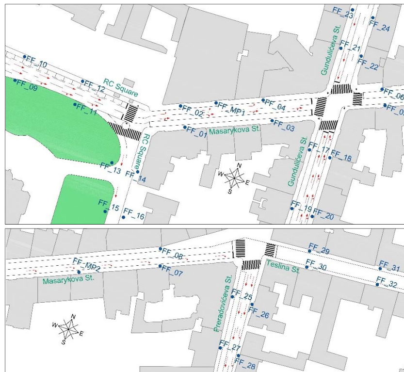
Figure 4. Locations of free field receptors

As it can be seen from Table 4, these average noise levels were higher than permitted in all analysed streets and periods, except in Teslina St. in day and evening periods. Consequently, a comparison between the average noise levels for current noise situation (S1) and the average noise levels for other noise mitigation scenarios (S2, S3, S4, S5, S6) was made (Figure 5).