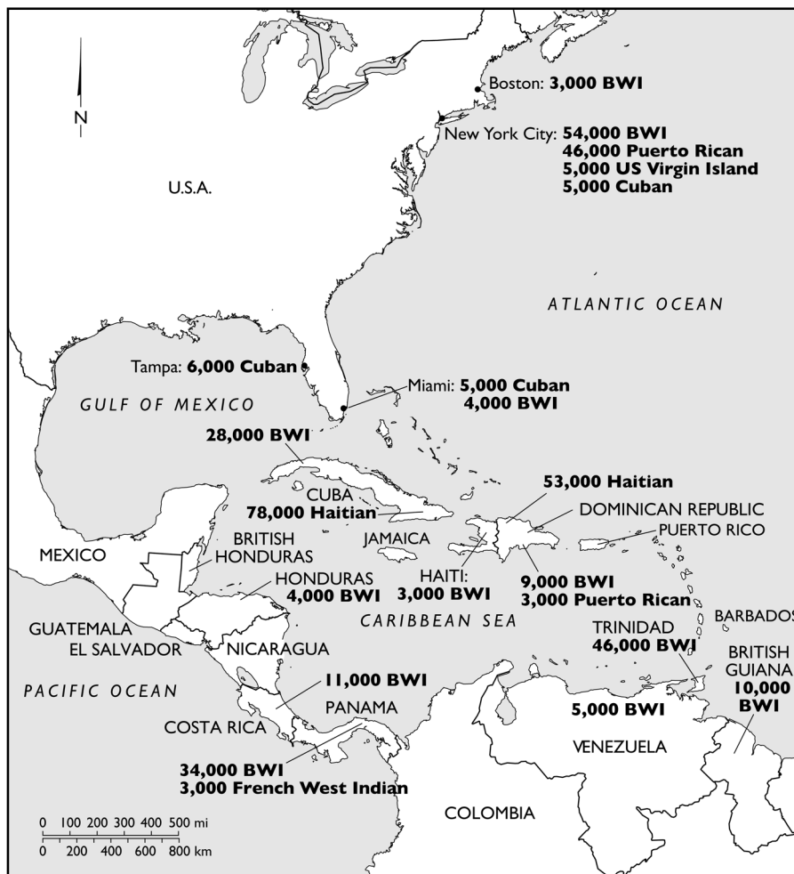
Caribbean-born People Living outside Their Places of Birth c.1930.

away in Panama. Jamaican newspapers carried obituaries from Panama, Costa Rica, and New York as a matter of course, identifying the deceased by (Jamaican) parish of origin and noting mourning sons and daughters scattered from Colón to Harlem.