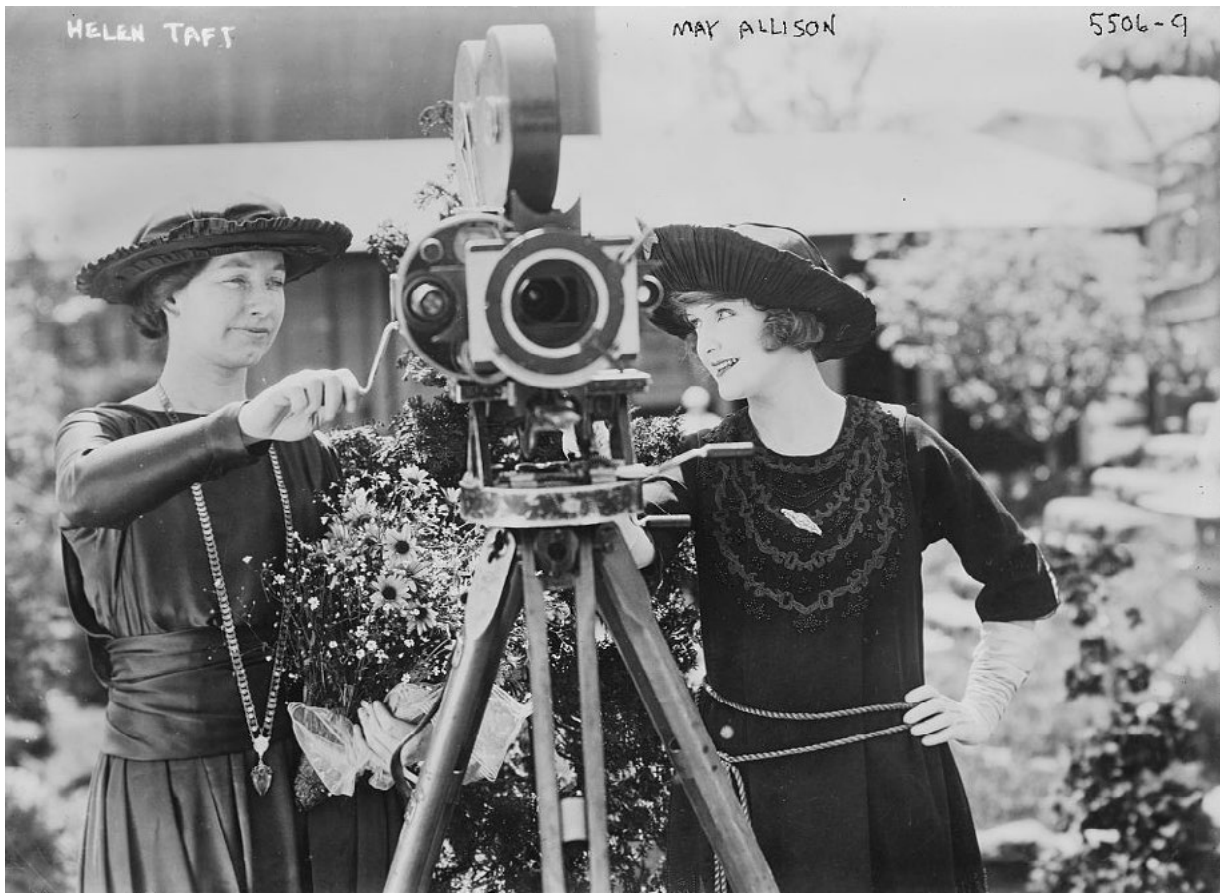
First Lady Helen Taft, behind the camera, with silent movie star May Allison, around 1910.