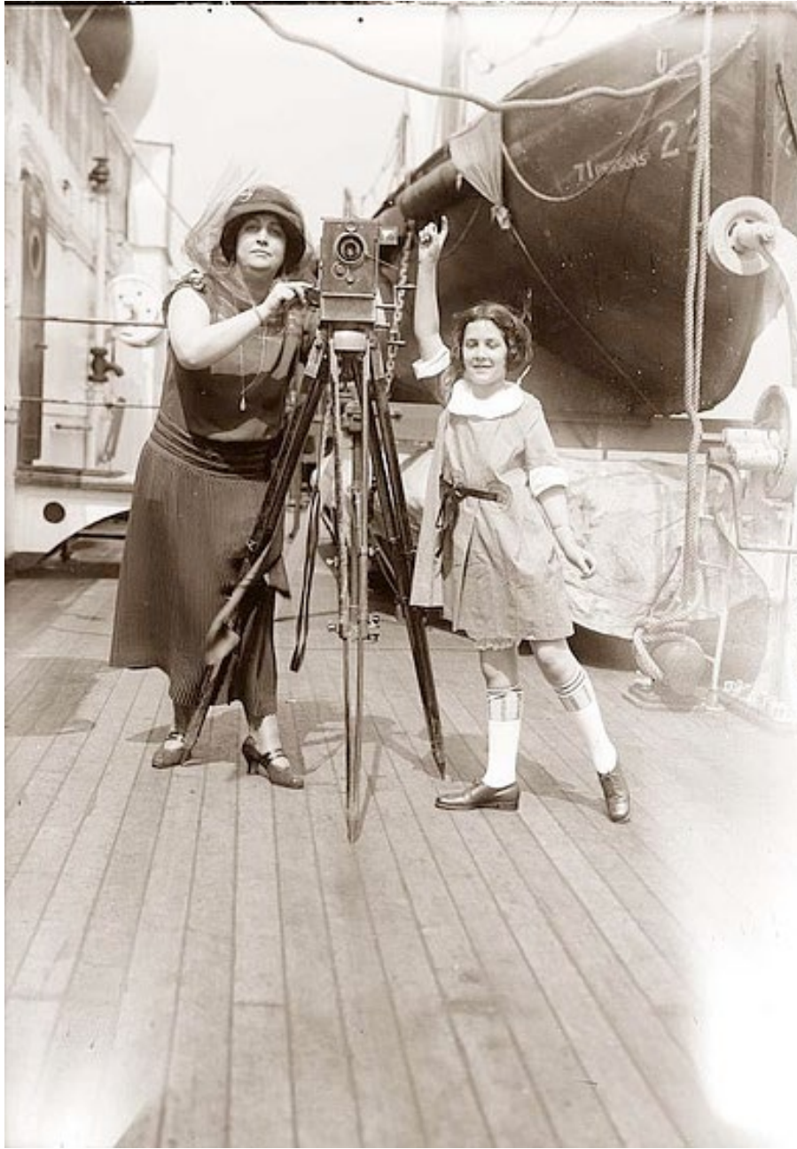
Unknown amateur camera operator.