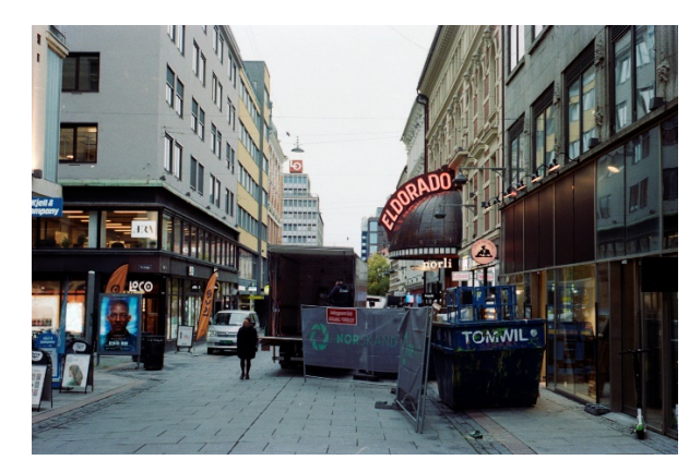
Early morning Oslo

hour. The first sunlight could be seen and the damp from the pavement began to evaporate. People were unloading vans and trucks and carrying boxes into the nearby shops. Yet my mind was firmly locked in the discomfort of walking along a line where a murderer had previously walked, even if he did not walk along Torggata, and even if thousands of other people had walked that street since. I saw the trucks with engines on in the city center and my mind leapt to the attack in Stockholm 2017, when Rakhmat Akilov drove a truck into the main shopping district killing five people. My mind was so occupied with thoughts of the two attacks that I chose to sit down at a café and gather my thoughts in order to be able to focus on the task at hand.