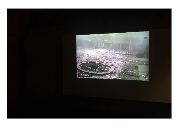
Video of explosion

safety. The site was protected from attacks, and I was being protected with it. The concrete obstacles that stopped cars from entering were green and shaped in soft forms; one even had an integrated bench. It was as if the barriers were inviting me in, making me feel welcome and offering me a seat to rest. However, all these precautions also sent out a strong sense of vulnerability. The barriers and the surveillance cameras were all there because the area was not deemed safe. I got the feeling that anyone, even myself, was seen as a potential threat (especially when documenting the site). I felt a mix of safety and unease. I felt as if I was welcome but still not wanted.