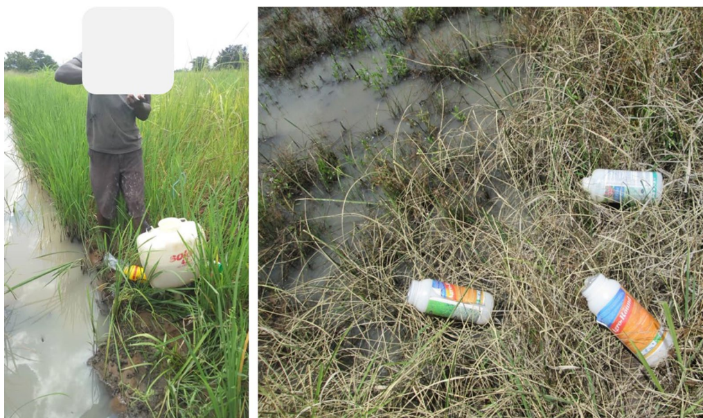
Fig. 2 Pesticides mixing, application and disposal practices among farmers observed in rice paddies, in the study area

amine salt) were commonly used during weeding to control soft weeds in rice farms: