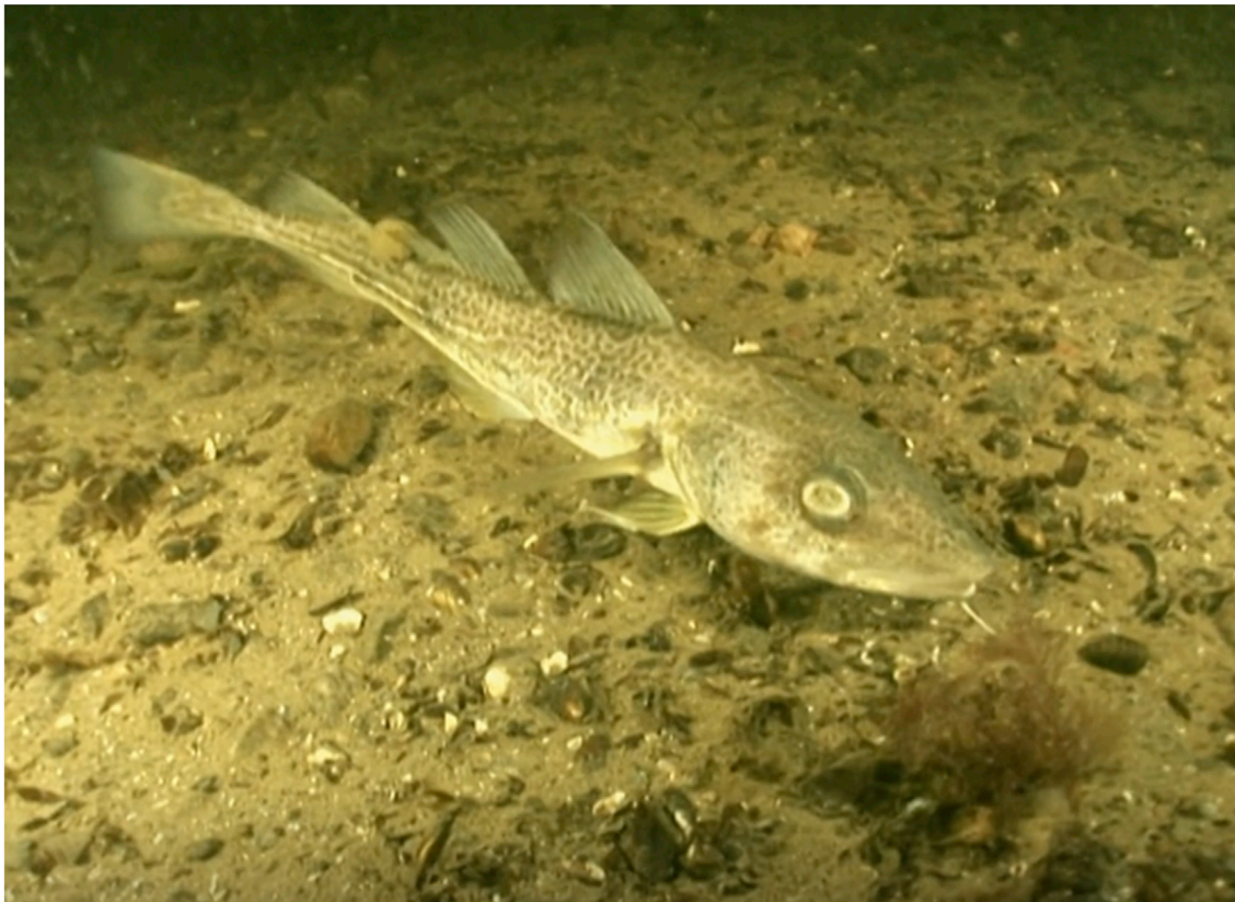
Figure 3. A Starving Baltic Sea Cod, whose Condition Has Been Affected by Extensive Time Spent in Hypoxic Bottom Water