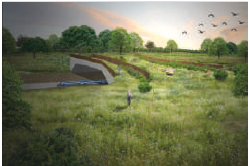
Figure 3: Illustration from student work by Julia Hellström, SLU Alnarp (2019).

Scania, which was in focus during the master course, is a densely populated region of Sweden, but with the population and villages in the plains scattered all over the landscape, rather than concentrated to fewer urban settlements