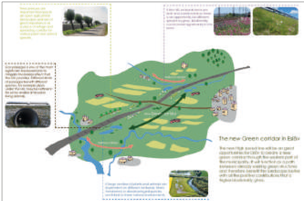
Figure 4: Illustration from student work by Johan Henriksson, SLU Alnarp (2019).

As stated earlier, the local or regional connection is of great importance since it will make it possible to avoid some problems, related to the project-centred