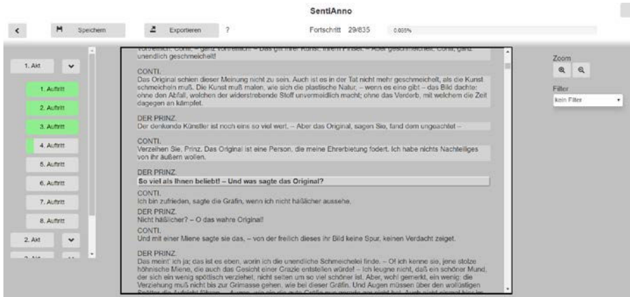
Fig. 2: Annotation view.

Figure 2 shows the overall view during the annotation process.