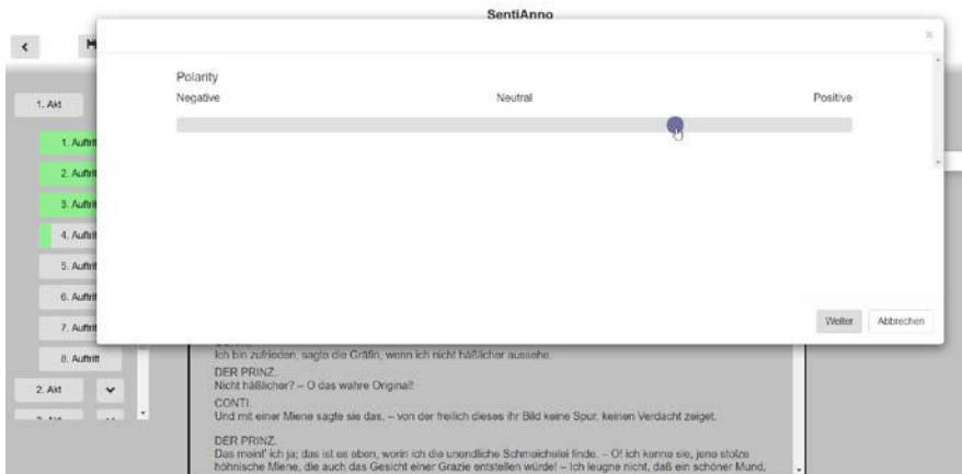
Fig. 3: Selecting an annotation.

When starting the annotation of a speech a new window appears where annotators can perform the annotation according to the previously defined scheme (figure 3).