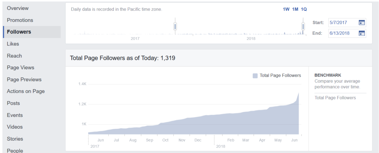
Figure 1. CDS Facebook page followership during 2017.

Below are two figures illustrating the increased engagement of CDS members throughout the project. While it is understood that not all of the increase can be attributed to the Fellows project, regular postings by Fellows certainly played a role.