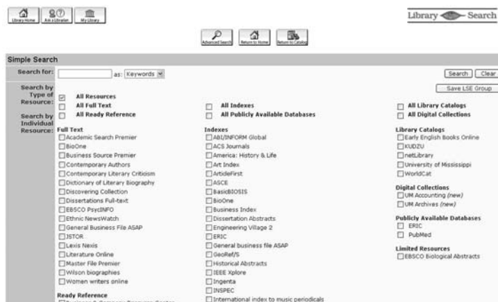
Figure 3. Master screen display (partial screenshot)

In setting these up, Subject Librarians have several choices to make. First of all, they choose the resources that will be searched. For example, the biology subject guide search box searches Academic Search Premier , BioOne , and JSTOR by default. BasicBIOSIS and PubMed are also available but are not checked by default. Users can check these search boxes if they also wish to search these resources. Choosing the resources to include in the search box as well as setting what resources are checked by default is the most important decision. The Subject Librarian is also encour-