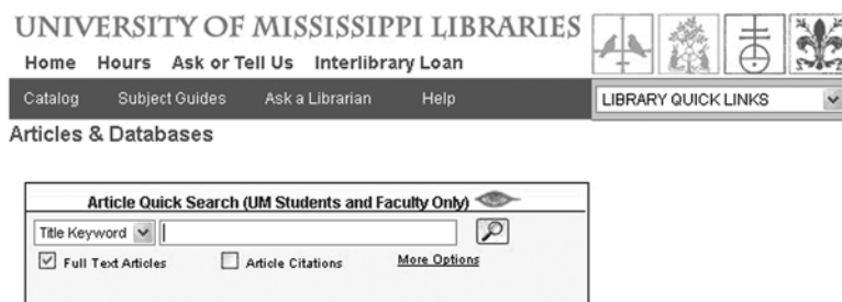
Figure 1. MetaSearch tailored search box with full text category selected

For authentication, the University of Mississippi Libraries purchased Innovative’s Web Access Management Module (WAM), which is based on the