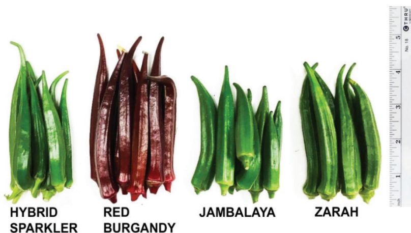
Figure 1. Photo of each variety of harvested okra.

The okra seeds were planted 0.6 m apart in the row and about 1.3 cm deep in a completely randomized design with three replications. The okra varieties were randomly assigned to plots in rows. Nutrient needs were supplied based on pre-plant soil test results using calcium (15.5-0-0) and potassium (13-0-46) nitrate fertilizers. Irrigation was supplied when needed to supplement natural rainfall. Harvesting commenced for Red Burgundy, Jambalaya, Zarah, and Hybrid Green Sparkler at 55, 55, 42, and 50 days after planting, respectively. Fruits were picked every other day (Figure 1). The number and weight (g) of okra produced per replication was recorded at each harvest. Analysis of variance (ANOVA) was done using JMP software version 11 (SAS Institute Inc., Cary, NC). Means were compared using the all pairs Tukey-Kramer HSD method, p values of < 0.05 were considered significant.