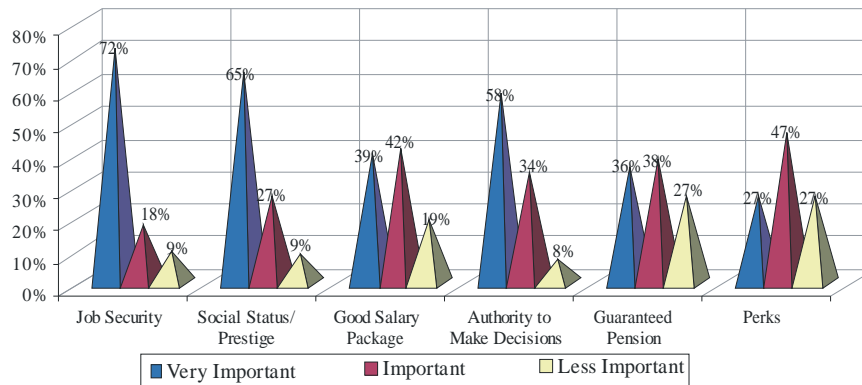
Fig. 3. Factors Influencing Students' Decision to join CSP

Gender-wise responses show that a majority of both male and female students considered 'job security', 'prestige and social status' and 'authority to make decision' as very important factors shaping their preference for the civil service. However, a majority of female students also considered 'good salary package' as a very important factor. 'Perks' were rated as an important factor by both male and female students.