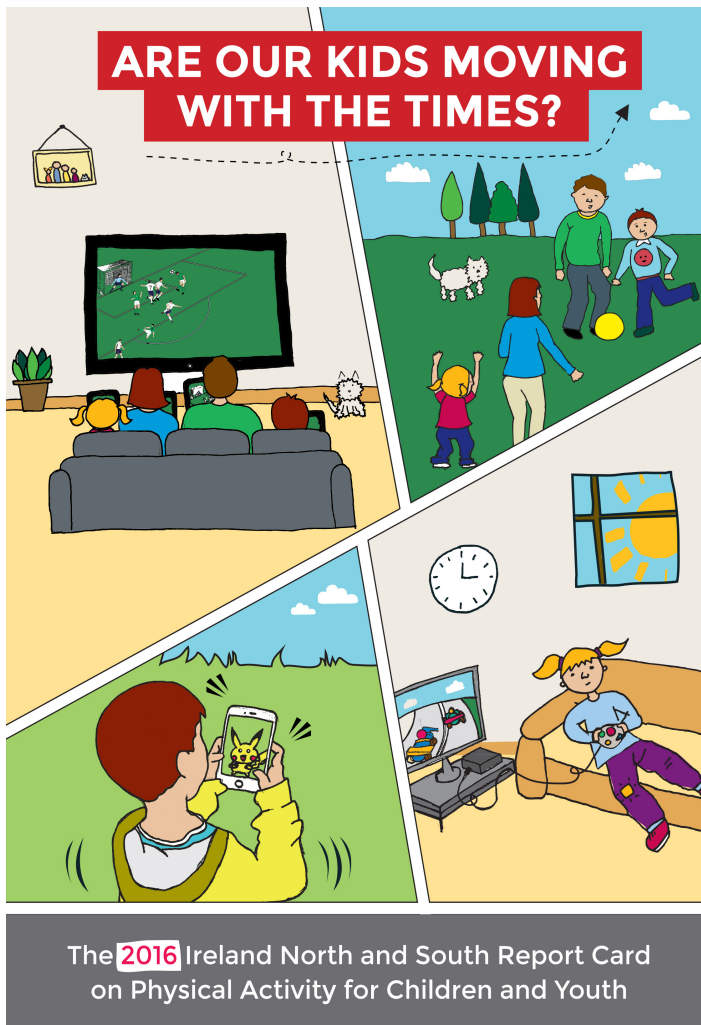
Figure 1 — Front cover of the 2016 Ireland North and South Physical Activity Report Card.