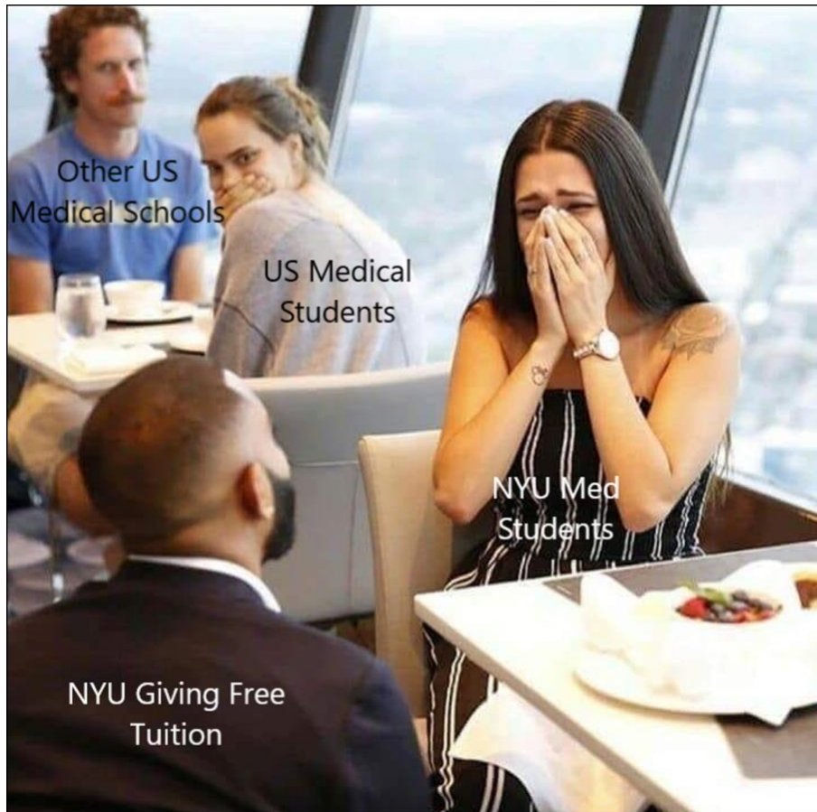
6. '[Shitpost] Facts' (/u/OmniaVinco 2018)

While NYU's move to waive tuition for all students could be seen as a step in reducing socioeconomic disparities amongst applicants, the move was mostly perceived as a public relations move on /r/medicalscool. One commenter asks how this will increase the competitiveness of NYU medical school admissions, which would then raise its already high position in the annual U.S. News and World Report ranking (163 karma) (/u/Timewinders 2018). Another writes, 'And just like that, the suicides of an MS4 [medical student, year 4] and a psych resident within weeks of each other fell completely out of the public eye' (503 karma) (/u/sakusendoori 2018).