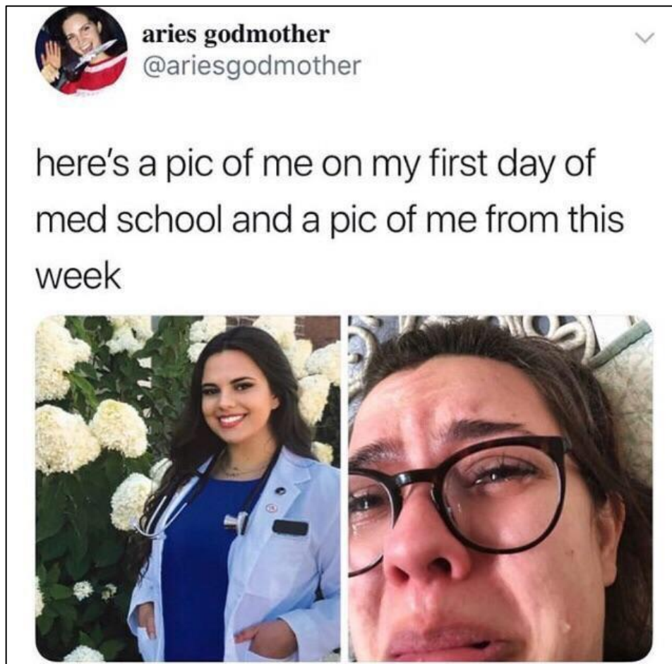
8. 'Oof [meme]' (/u/plantsandpremed 2019)

Despite the negative sentiment in the actual content of the post, comments expressing the sentiment that students who choose medicine love what they're doing received positive karma. It could be that many of the users that upvoted the post did not go into the comments to express their desire to quit, 7 or that negative sentiments are only surface-level and exaggerated for humor. Post 8, 'Oof [meme]' 8 (3.3k karma) (/u/plantsandpremed 2019), and its comments follow this pattern, presenting a dual message.