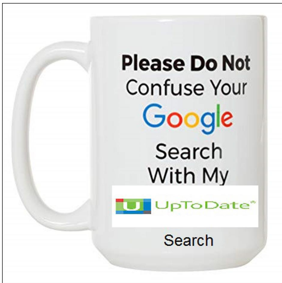
3. '[Shitpost] Primary Care be like' (/u/Spire_Slayer_95 2019)

Post 3, '[Shitpost] Primary Care be like' (3.2k karma) (/u/Spire_Slayer_95 2019), 3 further illustrates medical students' perception of the decrease in physicians' professional authority when clinical knowledge is challenged by patients who go to the web to research their symptoms and conditions in an effort to be more educated, and thus, empowered in the clinical setting. In contrast to the post in image 2, this post does not disparage patients.