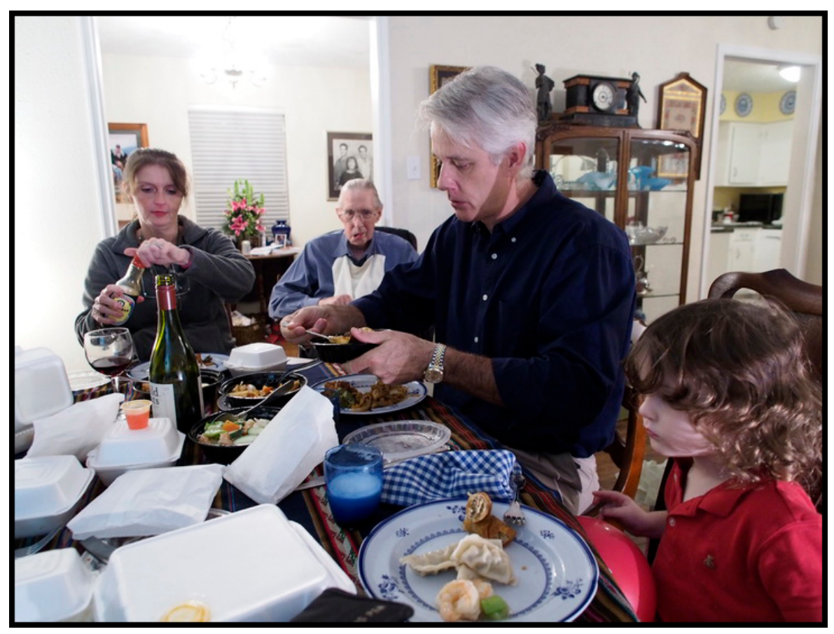
14. Family dinner at the cottage, 13 December 2016

The fall was not easy. Mom and Dad kept the 24/7 care through October, then decreasing the amount of support because of the expense and their desire for privacy. Setting up home health care visits squandered an exceptional amount of time and the turnover of providers was quite frequent (and annoying). Dad's medications, exercises, and nutrition required a spreadsheet to keep them organized and administered correctly. We got a refresher course on how to 'feed' Dad through the PEG and learned how to 'spot' him when using the walker. Life had become quite intense for the family, including Dad, as the simplest things were now struggles. New boundaries had been placed on their lives, some of which would become new 'normals'. One of the most difficult aspects of Dad's recovery was learning how to swallow again. The speech pathologists worked with him a few times a week, but he had to do his exercises on his own; these were quite painful for him to do, and his enthusiasm waned. He did not improve, prompting one of the therapists to casually remark to him that some patients never learn to swallow again. That incidental comment shook Dad's confidence in his own recovery, and despite his eventual physical recovery he never did surmount the swallow test.