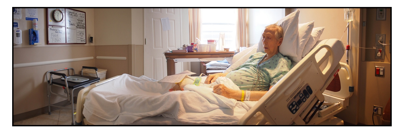
8. On the floor after the triple bypass surgery, 6 April 2015

The cardiac team advised our family that even though heart surgeries are painful, patients often feel better because their blood flow improves significantly. Once awake in recovery, Dad was alert and talkative, saying he felt really good despite the new scar running down his chest. Dad remained in the cardiac intensive care unit (CICU) for a couple of days to monitor his progress. By the third day he was reading, eating, and wanting to go home. Dad used his cell phone to call friends and video called his daughter and her family on the East Coast.