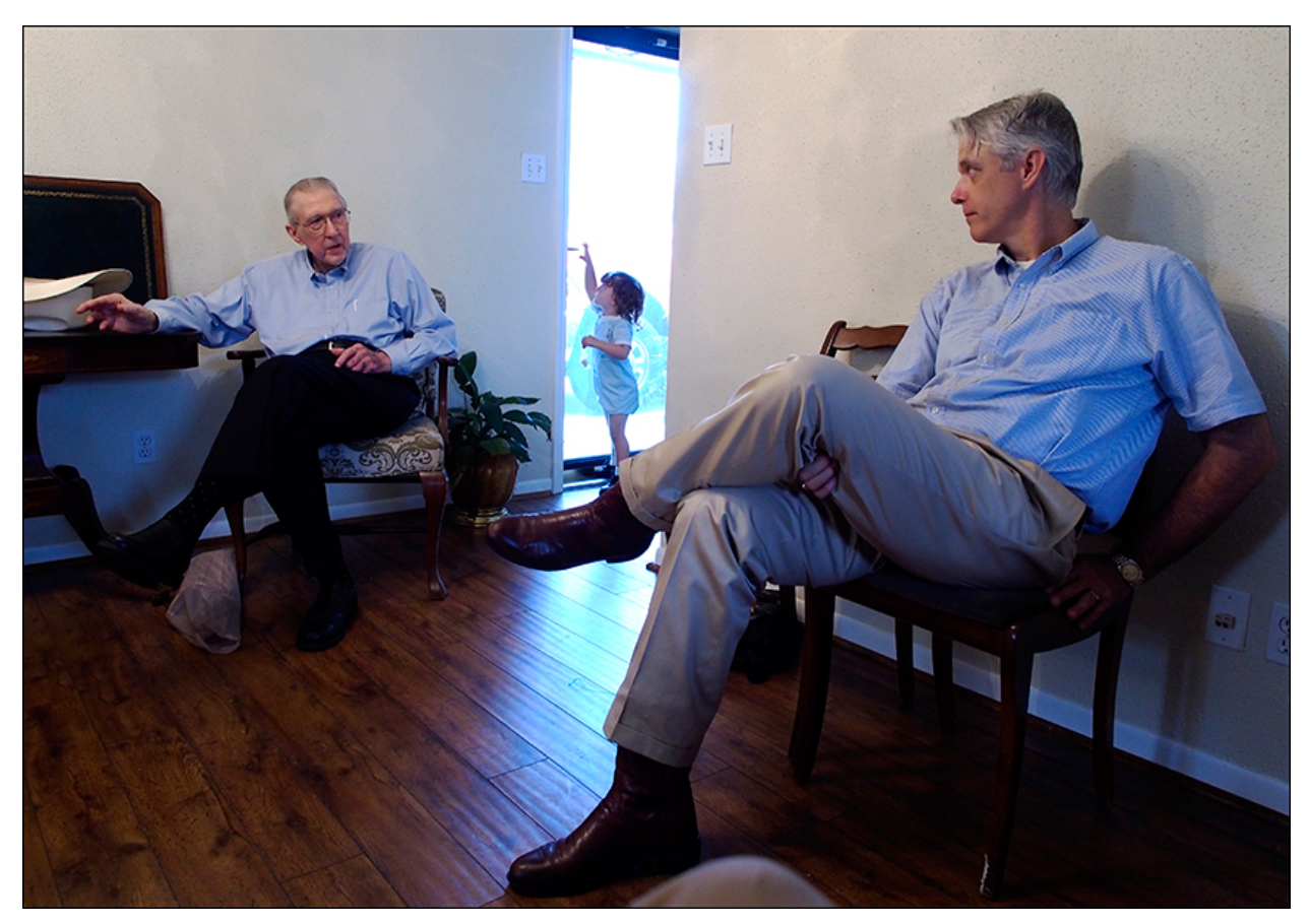
10. Relaxing in the cottage, talking with my brother after Easter lunch, 27 March 2016

By January 2016 my father's lower right jaw, the same area where the cancer had been, had begun to swell. The bump was sensitive to the touch and we encouraged him to have it looked at by his doctor; he thought it was an abscess. Dad visited an oral surgeon/dentist who took X-rays and determined the bump was not related to his teeth but to a growth on his jawbone. Dad refused to go through the radiation and chemotherapy again, but also was clear that he did not want cancer in his body. The surgeon suggested that they preserve the jaw by scraping the cancer off of it and a date was set for late July.