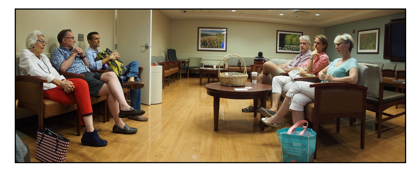
15. Family in waiting room of the CICU, 24 June 2018

The first week of June Dad complained of chest pains and thought he had suffered a heart attack. A trip to his primary care physician revealed he had not suffered a myocardial infarction. However, the following week his electrocardiologist's office called to say his ICD device had been 'firing' – a flutter of activity – and they wanted to see him as soon as possible. Mom took Dad in to see the specialist, who decided to immediately admit him to the CICU for observation. They wanted to monitor him closely to figure out what was happening.