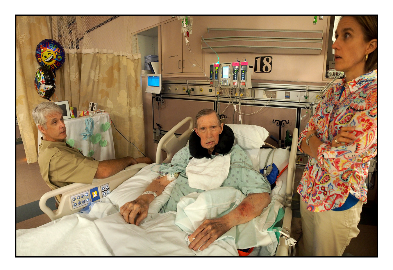
16. My brother and sister visiting with Dad in the CICU, 26 June 2018

We celebrated Dad's eighty-fourth birthday in the CICU; his nurses and caregivers brought him balloons, a card, and the neck pillow; his grandchildren, children, and other family visited, testing the limits of how many people could visit a patient at once.