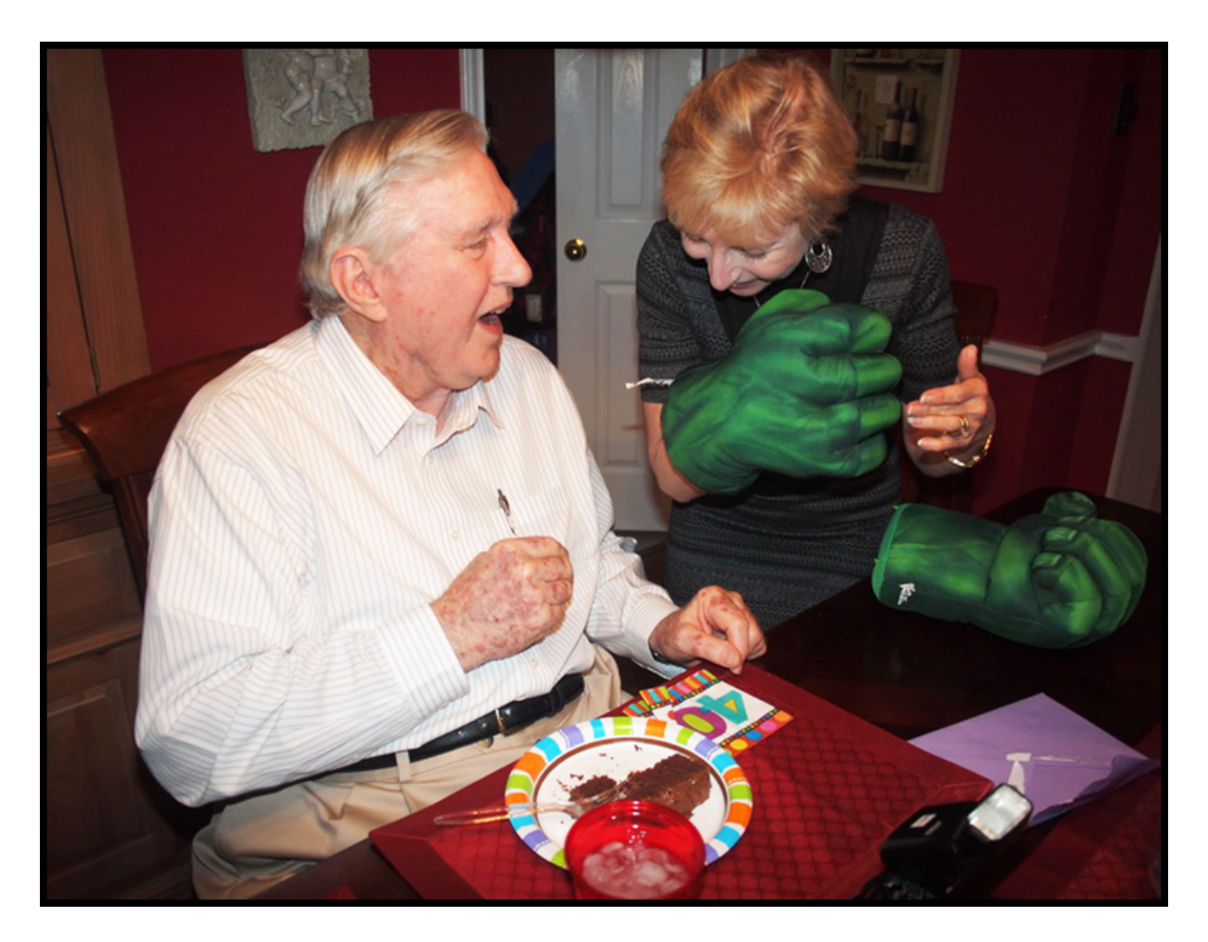
3. Family party doubles as a supportive moment, 18 February 2012

At a family gathering to celebrate one of his nephew's birthdays, Dad's niece gifted him with a pair of Hulk Smash Hands as a way of supporting his fight against cancer. The oncologist subsequently recommended simultaneous radiation and chemotherapy. There would be seven weeks of radiation, five days per week, for five to seven minutes each day. The eventual buildup of radiation would continue to kill cancer cells for up to two weeks following completion of the therapy. After the first two weeks he would experience a 'sun burn' on his tongue and throat, making it hard to swallow and eat. Most patients regain 80 to 100 percent of their sense of taste. Even though the physicians expected a full recovery, if there were problems with swallowing he could seek care from a speech pathologist to teach him how to swallow (again); in a worst-case scenario, a feeding tube (percutaneous endoscopic gastrostomy tube) would be administered. We learned from the physicians that many people undergo this treatment and 'get past it and enjoy their lives'.