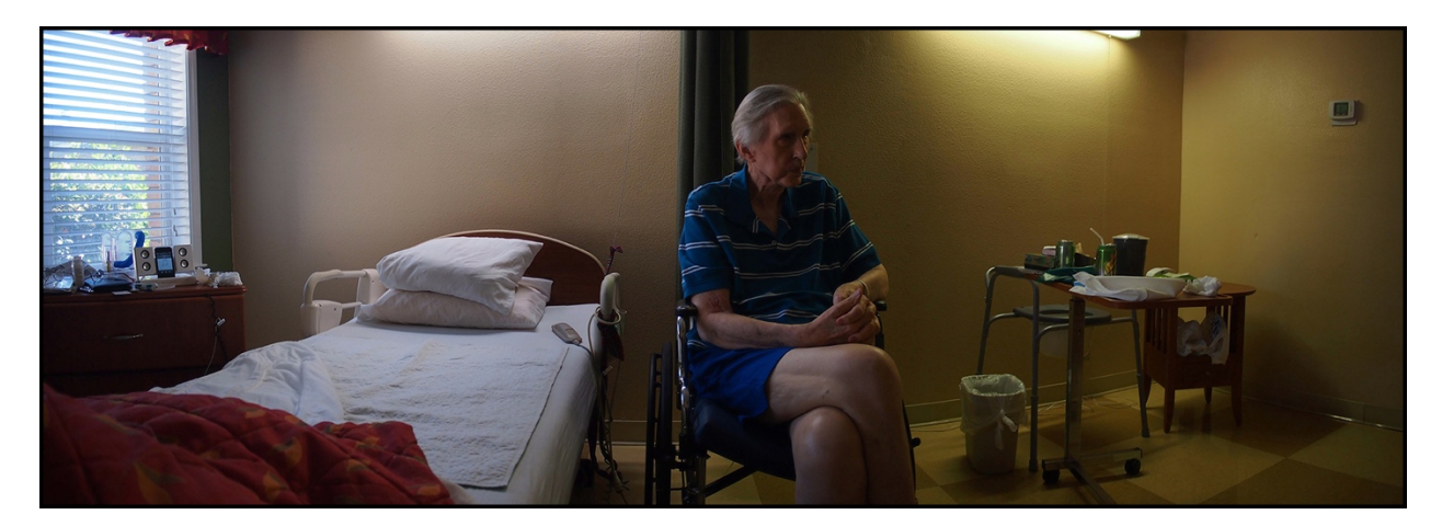
9. In his room at the skilled nursing facility, 25 April 2015

Dad moved to a skilled nursing facility a few miles away from his house. It was the best one his health insurance covered; it included physical therapy, occupational therapy, and open space for him to move around in. He could wear regular clothes and engage with other patients.