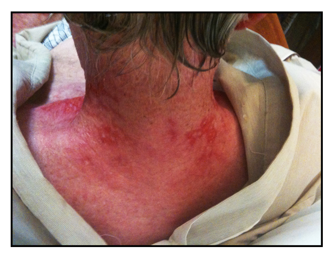
5. Burns from radiation therapy (the hair on his upper neck never grew back), 1 June 2012

Signs of the chemotherapy include an acne-like rash on the arms and upper body; we were told developing the rash indicated that the body was responding to the therapy.