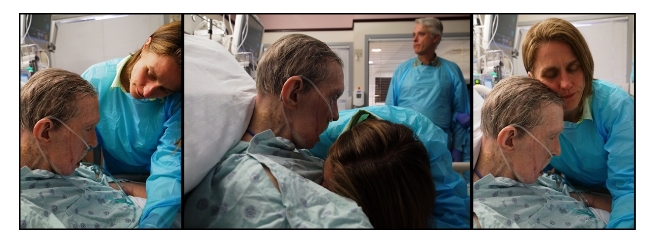
17. My sister has a personal moment with our father, 11 July 2018

Back in the CICU, Dad was placed in an isolation room because he had contracted methicillinresistant Staphylococcus aureus (MRSA) and had to be separated from other patients. Before entering his room we were asked to put on blue plastic disposable gowns and gloves, and were encouraged to wear a face mask. Teams of physicians rounded more frequently in the CICU but rarely shared their observations with the family; my sister and I engaged each one who saw Dad, inquiring about their strategies for him and his prognosis.