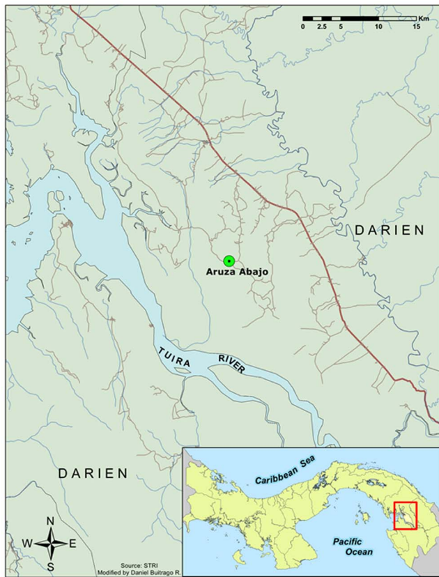
Figure 1. Map of Aruza Abajo study site in western Darien Province (Panama).