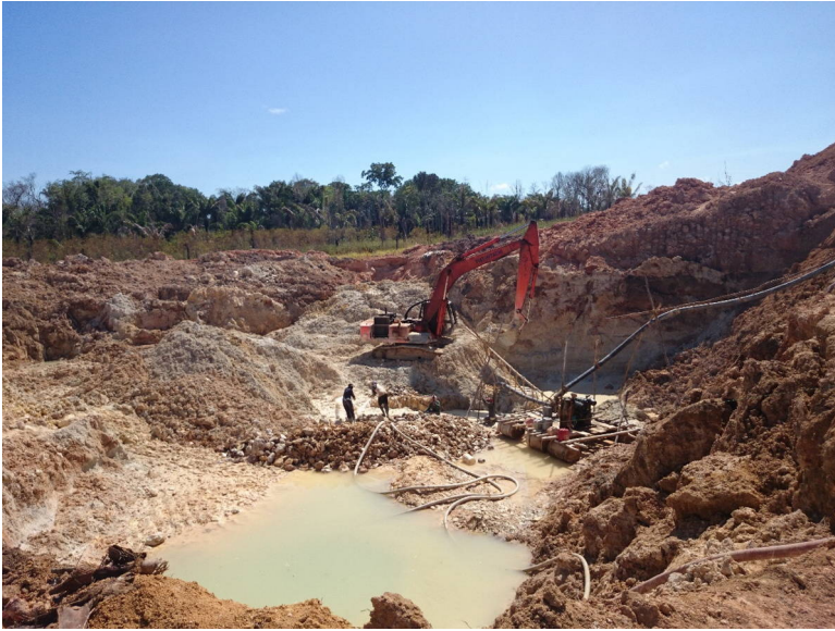
Figure 4. Gold Mining Operations taking place near Brownsweg, Suriname, 2014.

land for gold mining due to the fact that they are often expelled from lands when large-scale mining concessions are granted by the state government. 59