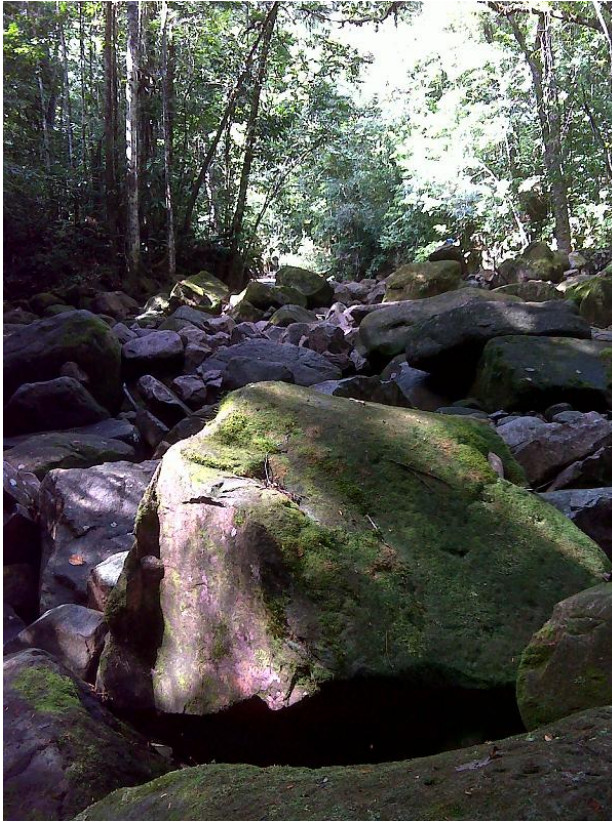
Figure 1. Weathered Rock and Emerging Vegetation in Kaieteur National Park, Guyana, 2010.

being of the wider Amazon basin, one of the few relatively intact forest ecosystems on Earth. 39 The weathering of rock over millennia generated the soil of the Guiana Shield as ‘granular representations of time’ 40 within which tropical rainforest was able to take root. The rainforest that emerged is remarkable in abundance, diversity, and rate of botanical endemism. 41