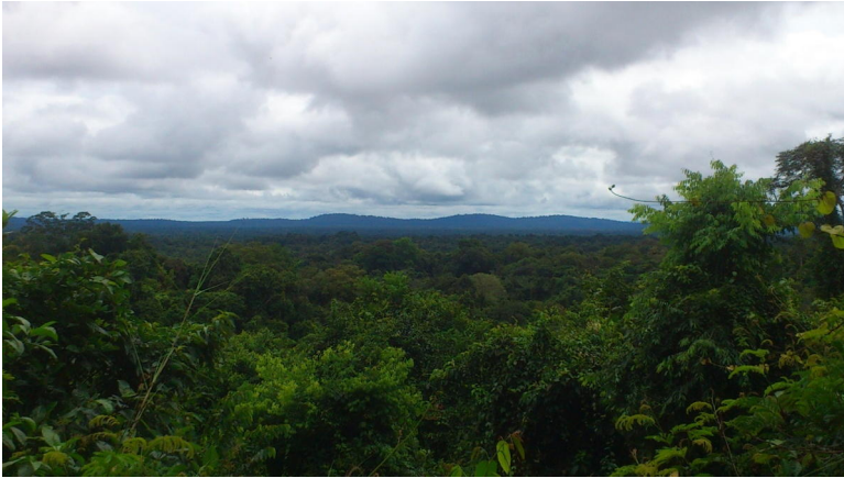
Figure 3. A View of Dense Canopy from a Mountain, Mahdia, Guyana, 2014.

[D]eforesting less than a third of the Guiana Shield, in areas currently under threat from mining, logging, and agricultural activities, could result in significant changes in the water cycle across the continent. This includes large variations in temperature and precipitation affecting areas 4000 km away, impacting ecosystems and economies, with consequences for society. 44