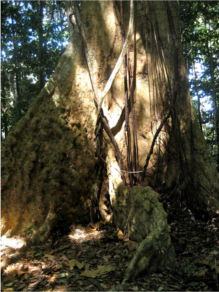
Figure 2. Cracks of Light in the Forests of Brownsberg Nature Park, Suriname, 2014.

The verticality of the forests as they move from soil to atmosphere is more than just visible. Emerging vertically from weathered rock, the forests of the Guiana Shield also influences weather. The forests of the Guiana Shield are guardians of the water cycle of the South American continent. 43 As hydrologist Isabella Bovolo described: