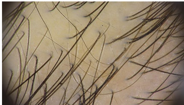
Figure 3 - AGA Trichoscopy: anisotrichia greater than 20%, without peripilar activity.