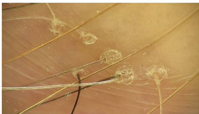
Figure 4 - Trichoscopy: absence of follicular orifices in a large extension of the field (cicatricial alopecia), mild inter-pilar erythema and marked peripilar activity, consisting of circumferential desquamation (peripilar casts) and follicular plugs. Note the absence of vellus hair.

shape around the hair: peripilar casts. When surrounding the emergence of a tuft of 2-3 hairs, they are very typical and represents the optimal biopsy site for histologic diagnosis. 2,6-9 Other trichoscopic features are common to AGA, like hair diameter variability and predominance of single hair follicles. The presence of vellus hair in FAPD helps to distinguish it from classic LPP (Fig. 4). In patients with dark skin, a honeycomb pigmented network and scattered white small patches may also be seen, similar in presentation to what is seen in central centrifugal cicatricial alopecia (CCCA). 2,9 Dermoscopy alone may not be sufficient to distinguish between CCCA and FAPD in dark-skinned patients.