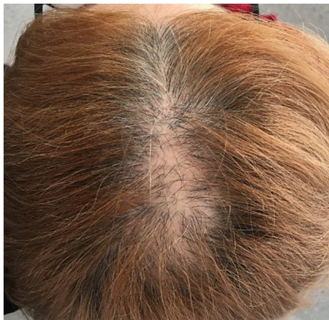
Figure 1 - FAPD in a 60-year-old woman, with hair loss on the crown resembling androgenetic alopecia.

Regarding trichoscopy, the most important distinguishing findings between FAPD (Fig. 2) and AGA (Fig. 3) are loss of follicular openings, perifollicular erythema, and perifollicular hyperkeratosis. The last may have a tubular