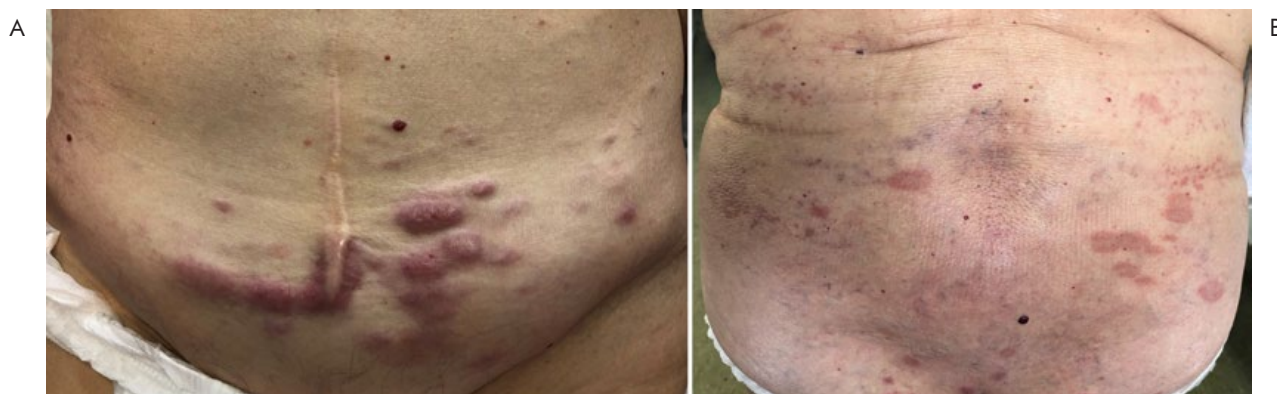
Figure 1 - (A) Several firm, erythematous confluent nodules and tumors on the suprapubic area. (B) Numerous erythematous patches and plaques on the dorsolumbar region.

Laboratory evaluation revealed normal complete blood counts, but elevated lactate dehydrogenase (438 U/L; N<225) and beta-2 microglobulin levels (4550 µg/L;