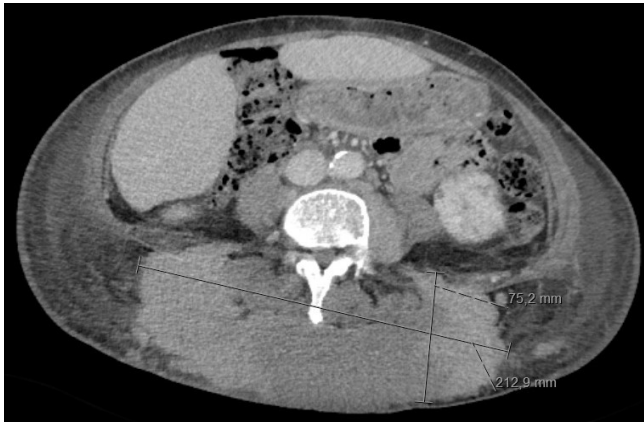
Figure 2 - Computed tomography scan showing a large subcutaneous mass of 17x21x7, 5cm, involving the skin and the adjacent left lumbar and gluteal muscles.

N < 2350 ). A full body computed tomography scan identified numerous inguinal, pelvic and retroperitoneal lymphadenopathies, along with a large subcutaneous mass involving the skin and the adjacent left lumbar and gluteal muscles (Fig. 2).