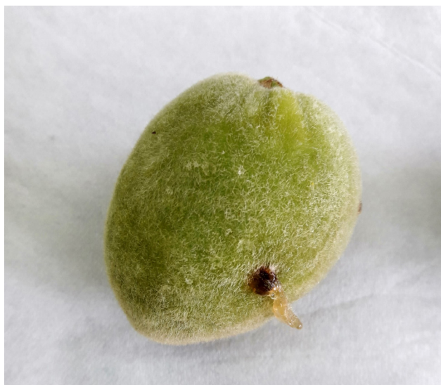
Figure 1. External symptoms of the disease on an immature almond fruit.

Pathogenicity tests were conducted on 8 healthy immature almonds fruits, 40 days after the setting, and the results were verified according to Koch's postulates. The disinfected fruits were injured at a depth of 0.1 mm in the