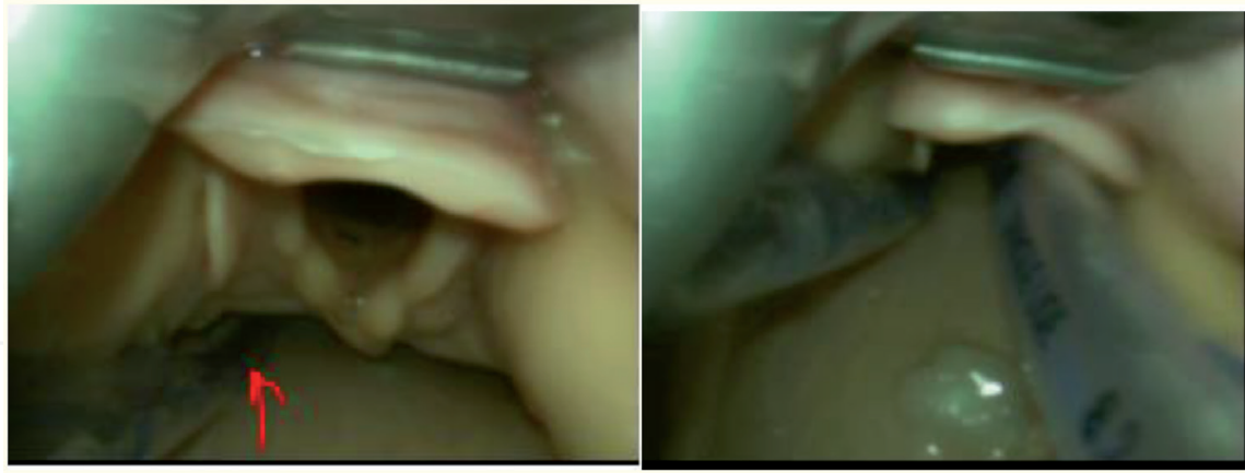
Figure 3. A videoscope picture showing the SALAD technique. On the left, suction catheter advanced in upper esophagus. On the right, ETT in place while the suction catheter in upper esophagus.

Suction of pharyngeal contents decrease the volume of aspirates to the lung, thus could decrease the severity [39].