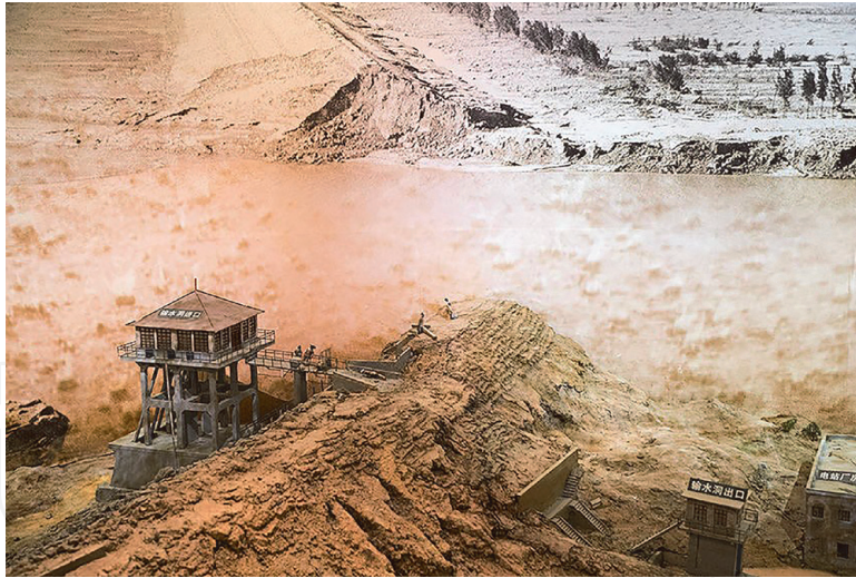
Figure 1. Final breach of Banqiao dam.