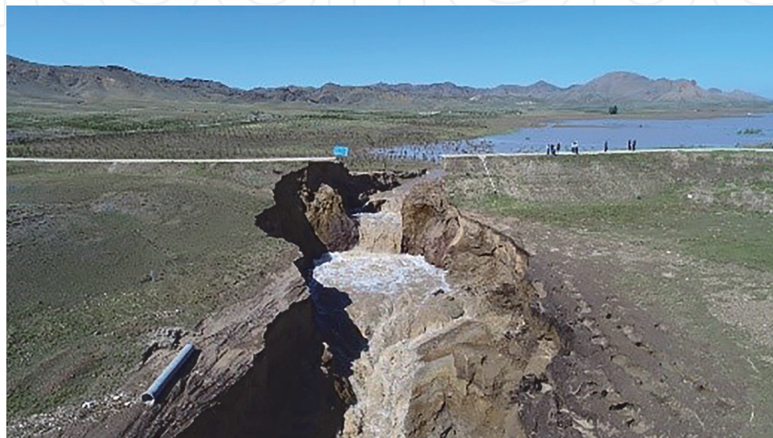
Figure 3. Final breach of Zenglongchang dam.