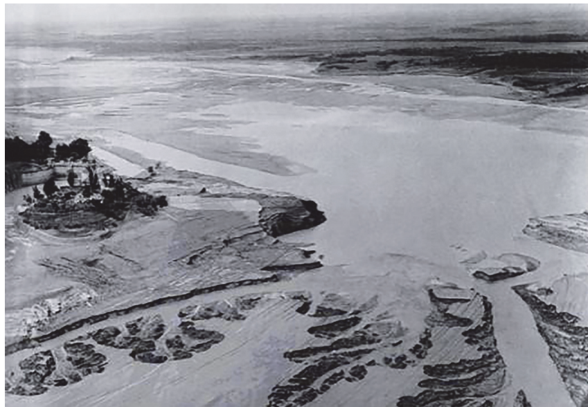
Figure 2. Final breach of Shimantan dam.