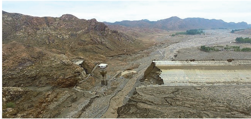
Figure 4. Final breach of Sheyuegou dam.

evaluation of the consequences of dam collapse and the preparation of emergency plans. This article will briefly introduce the research progresses on the mechanisms and numerical models of earth-rock dams' breaching, especially the latest research results of the author's research team in recent years, and make suggestions for future research.