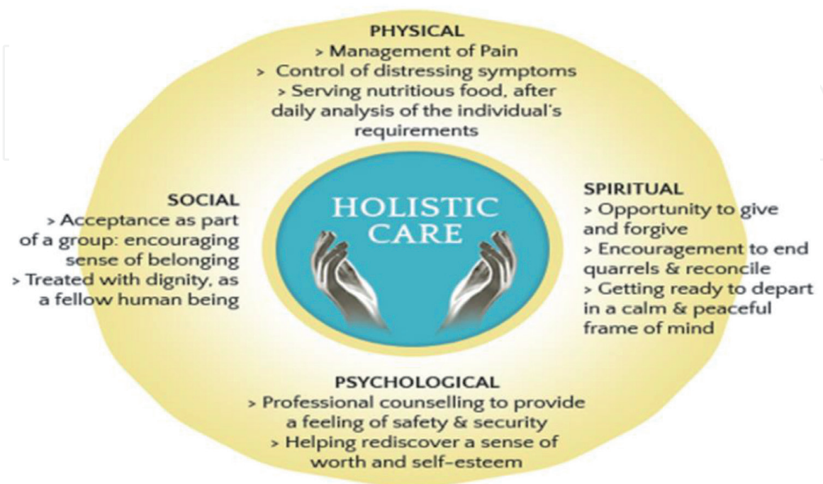
Figure 1. Diagrammatic presentation of the components of holistic care.