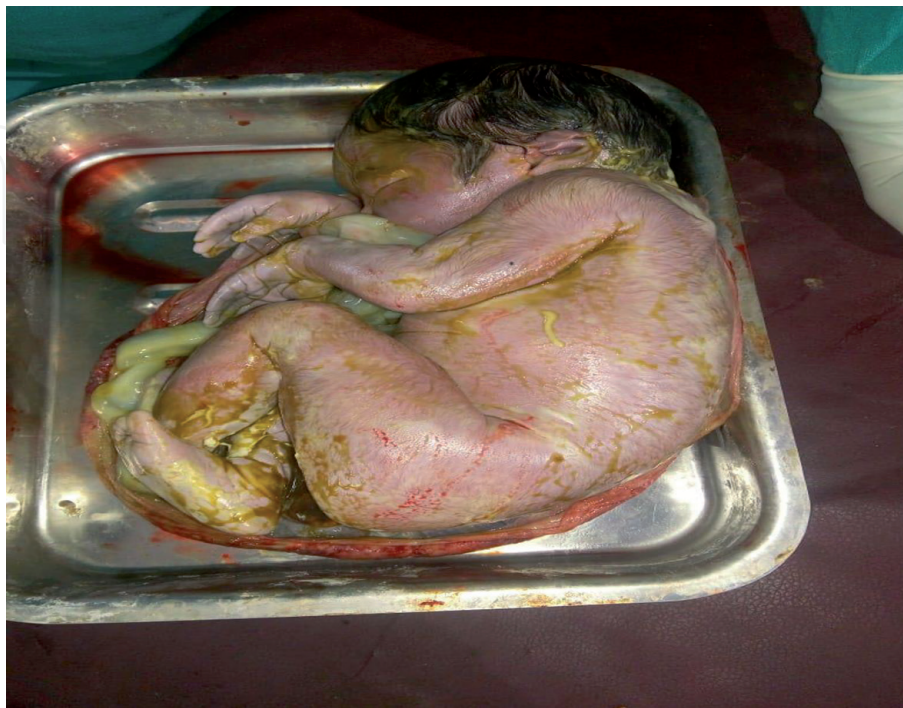
Figure 4. Vernix caseosa, scalp and body (lanugo) hairs and fingernails reach fingertips.