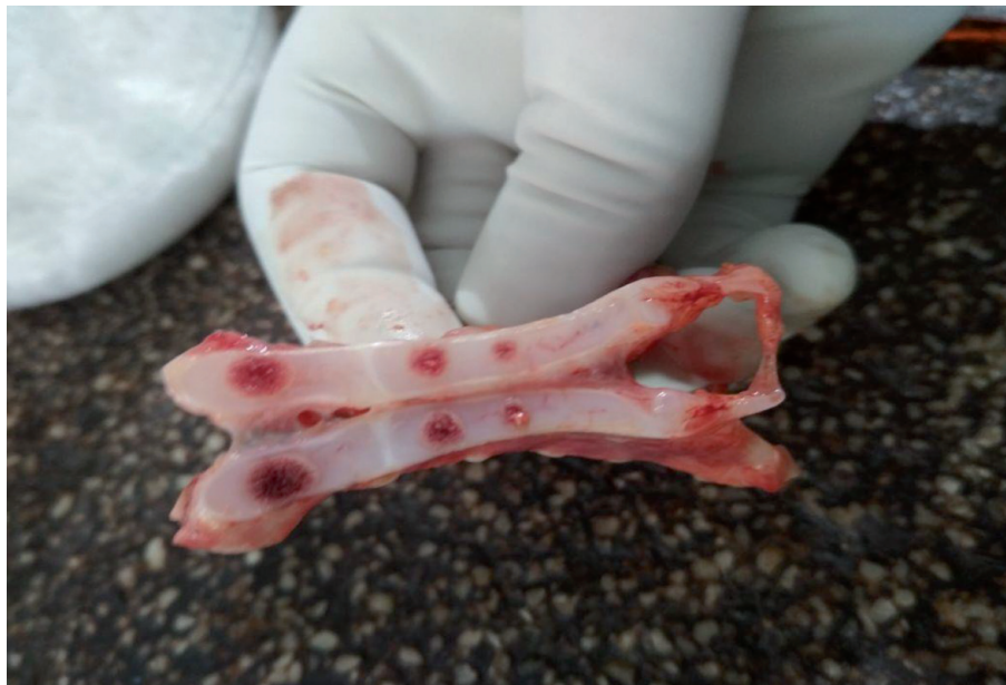
Figure 6. Ossification centre of body of sternum.