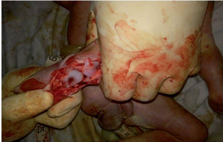
Figure 5. Ossification centre of Talus bone i.e. 5 months.