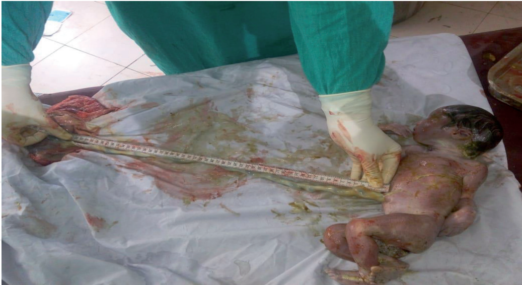
Figure 1. Measuring the length of umbilical cord.

7. Chest circumference (at the level of the nipples) in cm.