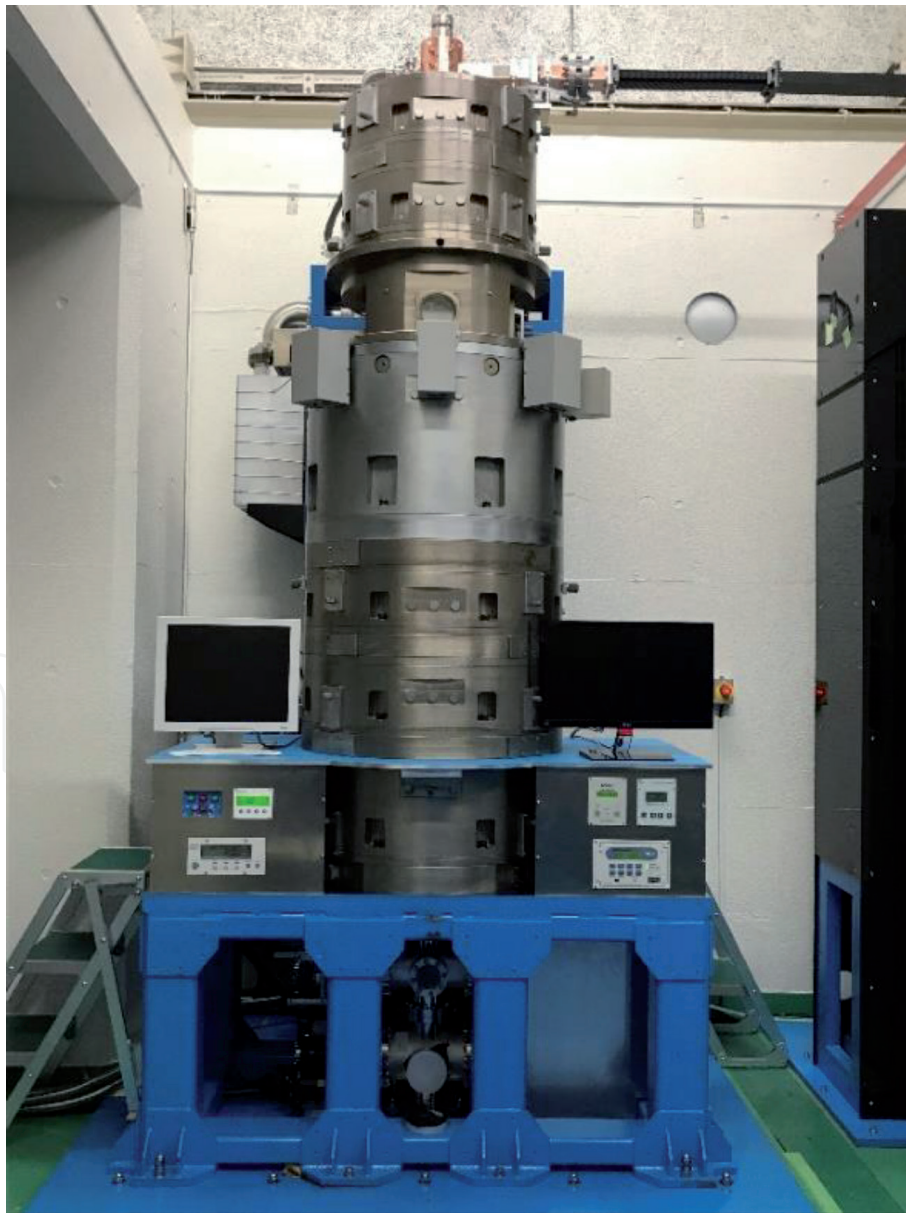
Figure 1. Photo of UEM with relativistic-energy femtosecond electron pulses constructed at Osaka University [13, 14].

Next, the electrons pass through a series of condenser lenses, which use magnetic field to precisely control the intensity of the beam, and its illumination angle on the sample. A relativistic-energy electron imaging system, including an objective lens, an intermediate lens and two projector lenses, is used to magnify the microscopic images. Finally, the images are recorded with a viewing screen (scintillator)