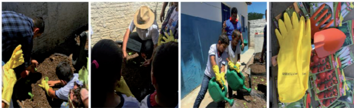
Figure 2. Planting with technical guidance.

In addition to providing a better nutrition to school students, it also ensured a greater awareness about the natural assets and valorous vision about the