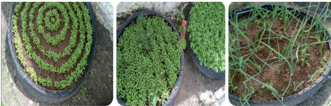
Figure 3. Vegetable bed with the use of tires.