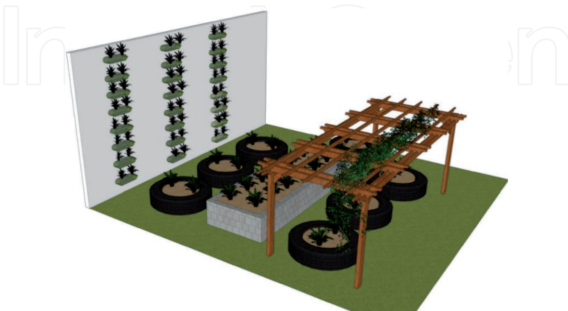
Figure 1. Proposal of an agropedagogical space of recyclable materials.

With the short space, it was proposed to build units of vertical vegetable gardens using pet bottles that can be collected by students at their homes, vegetable gardens