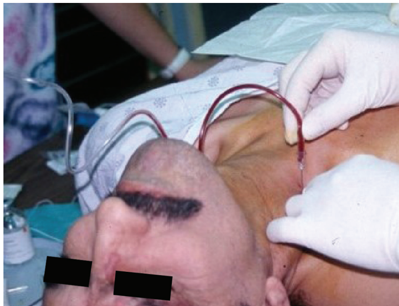
Figure 2. Accidental arterial puncture during a stellate ganglion block in a patient with postherpetic neuropathy.

is equally rapid since LA quickly redistributes from the cerebral circulation [25]. Figure 2 shows an intra-arterial puncture detected during the blockage of the stellate ganglion in a patient with herpes zoster neuropathy.