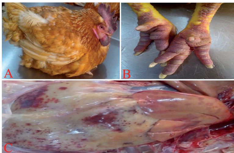
Figure 6. (A) A layer chicken showing clinical signs of weakness and sitting on hock; the comb and wattles are congested, and the wattles are swollen. (B) The feet and shank are severely hemorrhagic. (C) The abdominal fat depot shows petechiae to ecchymotic hemorrhages which are sometimes diffuse; the liver is necrotic and friable, i.e., color is bleached and has fatty appearance.

Ducks oftentime show one or more lesions of the circulatory system and showed nervous lesions of neuronal and Purkinje cell necrosis of the cerebrum and cerebellum [31]. There was nasal exudation, airsacculitis, and pneumonia in some ducks [31]. Enteric petechiation and ecchymoses were also observed [31] ( Figure 7 ).