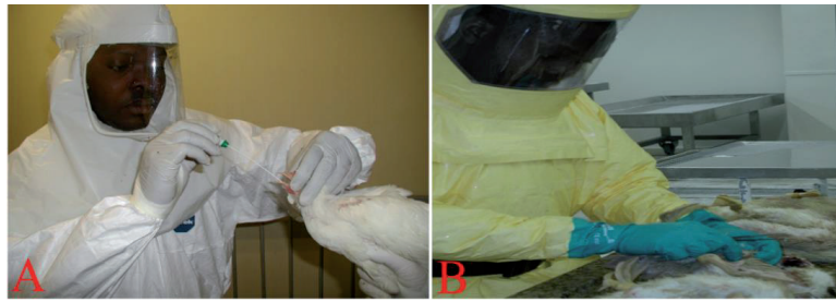
Figure 5. (A) Testing for influenza virus using oropharyngeal swab stick. (B) Examining suspected outbreak of influenza virus infection in poultry.

recumbency. Others ranged from nasal discharges, dyspnea, coughing, sneezing, shank hyperemia and hemorrhage, inability to stand, ataxia, and torticollis. In layers, egg structural abnormalities such as shell-less egg, white-colored eggs, and soft eggs were reported.