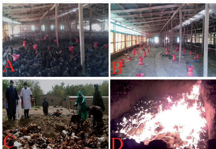
Figure 4. (A) An open-sided layer chicken pen infected with highly pathogenic avian influenza virus. (B) The flock in A when the pen was already depopulated. (C) The poultry birds been placed in an open dug pit after depopulation. (D) The flock in A been burnt after depopulation.

Individual birds are listless and exhibit edema; cyanosis of the comb, wattles, and legs; and diarrhea. Sudden deaths without any symptoms may also occur. Signs observed and reported are sudden death, high mortality, weakness, and