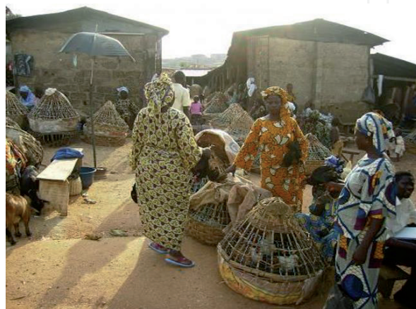
Figure 3. A typical live bird market where poultry from different origins are sold.

Enforcement of movement control, surveillance (active and passive), and prompt payment of the revised compensation to the affected farmers, including reorganization of the LBMs which led to the successes recorded during the