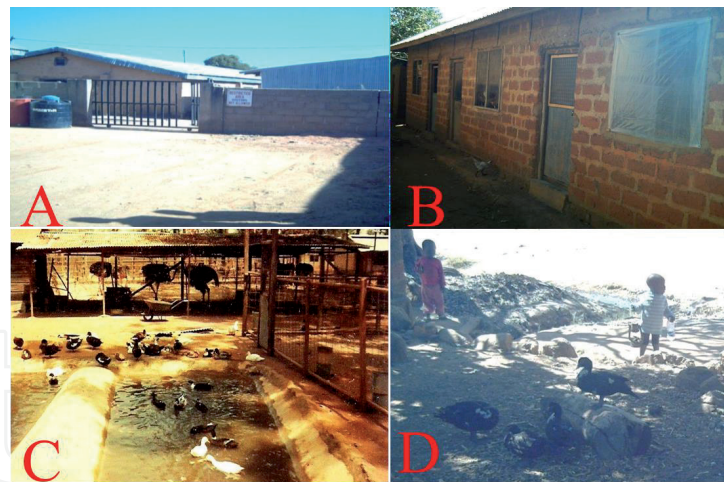
Figure 2. (A) Intensive poultry production system in the tropics [36]. (B) A semi-intensive poultry production system in the tropics [36]. (C) A mixed species backyard poultry production system comprising of ostriches, geese, Muscovy, mallard, and Pekin ducks before the introduction of HPAI [36]. (D) An extensively (free-ranging) reared Muscovy/mallard duck flock [36].

migratory routes of wild birds, evaluation and upgrading of veterinary services, ban on importation of poultry and poultry products, and increased surveillance for the virus [37]. Surveillance and disease reporting included passive and active surveillance and regular disease reporting. The active surveillance component involved epidemiological surveillance of network of 170 points within the country and targeted surveillance of wetlands and farms [37]. Surveillance was carried out between September and November 2005 at the Nguru-Hadejia wetlands [37]. Similarly, active surveillance was carried out in the same period in the high-risk agroecological farming areas and among live bird (poultry) markets, but all these surveillance activities failed to detect H5 or H7 avian influenza virus [37]. Several investigations have been carried out and are available to the public about the HPAI H5N1 outbreaks in Nigeria, including the virological identification and confirmation [26, 28, 37, 38], epidemiology and pathology of early [7] and resurgent outbreaks [39], and molecular characterization [29], including regional mortality and morbidity characteristics [40].