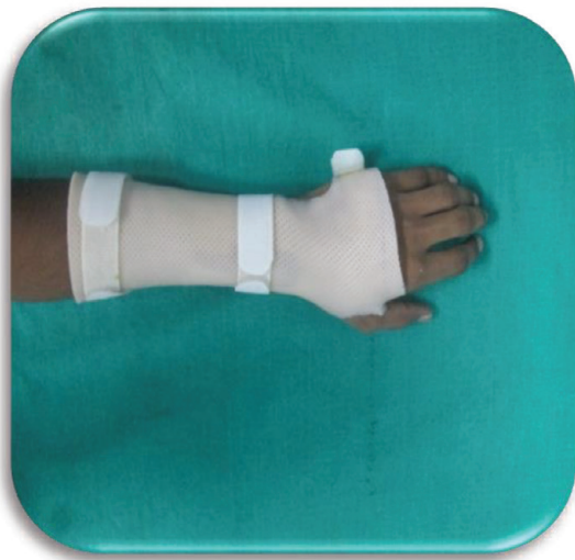
Figure 2. CTS dorsal splint.