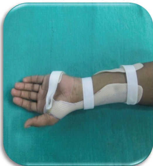
Figure 3. CTS wrist hand orthosis with thumb extension.