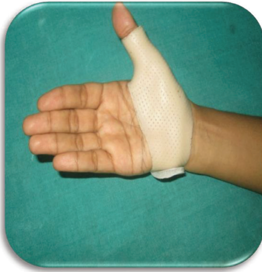
Figure 4. CTS carpal lock splint.