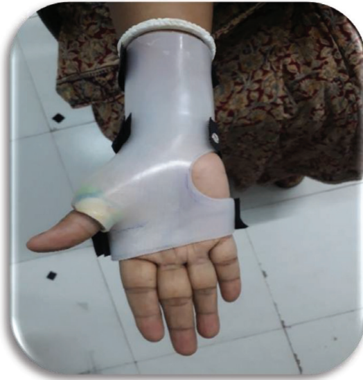
Figure 5. CTS thumb spica.