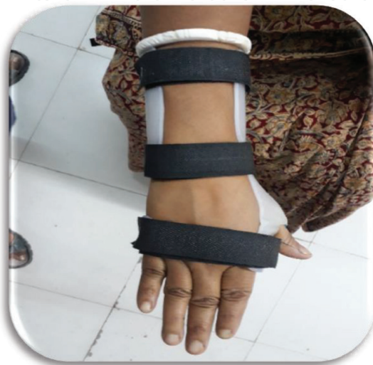
Figure 6. CTS thumb spica.