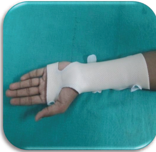
Figure 1. CTS volar splint.