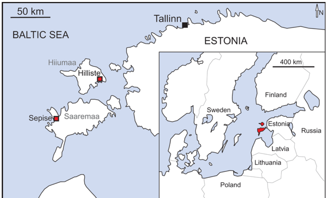
Figure 1: Locality map of crinoids with symbiotic borings.