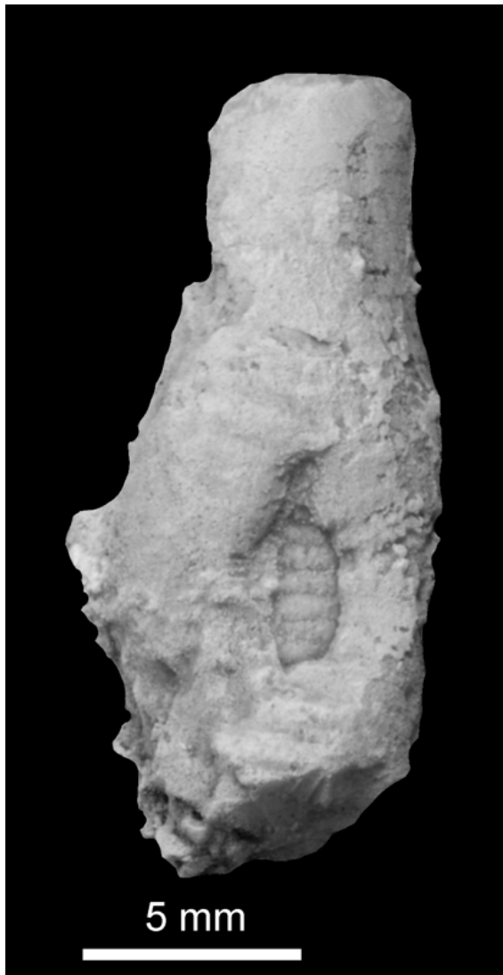
◀ Figure 2: A crinoid pluricolumnal with single Tremichnus from the Rhuddanian (Hilliste Formation) of Hiiumaa Island (Hilliste quarry) (TUG 1692-1).

One crinoid pluricolumnal (Fig. 3A-C) with multiple ( n=14 ) Tremichnus was found in the Jaagarahu Formation (Sheinwoodian) of Saaremaa Island. The borings are smaller and larger conical pits that penetrate the column wall around the circumference of the stem. These pits have circular outlines, rounded edges and straight-sided walls. The crinoid pluricolumnal appears to be slightly swollen at the pits. The diameter of the outer edge is 0.2 to 1.9 mm ( n=14 , mean 0.9 mm, sd=0.47 ).