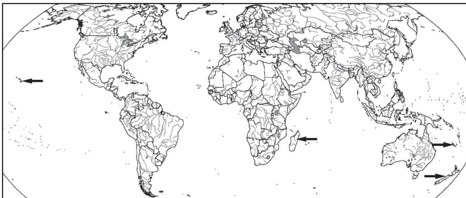
Figure 1. — Map showing the location, relative size, and degree of isolation of our four focal land masses (arrows): Madagascar, New Zealand, New Caledonia, and the Hawaiian Islands.

This paper will explore and test Darwin's ideas concerning these topics. This task has recently become much easier. Inventories of flowering plants, birds, mammals, etc. on different land masses are more complete, and the history, both natural and geological, of these land masses is better understood (e.g. Carlquist, 1980; Worthy & Holdaway, 2002; and especially Goodman & Benstead, 2003). The role of competition in adaptive divergence has been demonstrated more clearly. Clocked molecular phylogenies are increasingly available. Finally, Burness et al. 's (2001) study of how the sizes of a land mass' largest carnivore and its largest herbivore vary with its area has opened new perspectives. We will focus mainly on Madagascar, New Zealand, New Caledonia and the Hawaiian Islands (Fig. 1), comparing them with other land masses as appropriate. First, we will briefly outline the geological and biological history of these islands. Next, we assess the independence of the evolutionary experiments they harbored, comparing their degree of endemism, the role of colonists from overseas, and the extent of their adaptive radiations. We then discuss the relation between their distances from the nearest continents, and patterns of endemism and diversification in ferns, seed plants, and birds. Next we compare local and total diversity on isolated land masses of different area. To compare the severity of competition and the pace of life on different land masses, we first ask