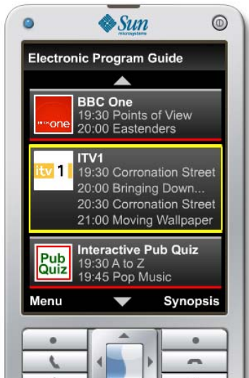
Figure 3: The Rich Media Mobile Browser in action showing the Electronic Service Guide listing available services to consume

Play-out of Mobile Interactive Services is a key part of the Rich Media Mobile Browser. The browser can render and provide interactivity based on the proposed SVGT-based Mobile Interactive Services format by parsing through the retrieved document and identifying user interface elements and performs their associated actions. For example, if the browser discovers a graphical element such as a <rect> (a rectangle graphic) has been specified to act as a button, it will obtain the button's required action through its action attribute. The action value will provide the details of what action to take should the button be clicked on or selected using the device's navigation keys or keypad. The tie-up between the user interface graphics and their actions for interactive services are created using the Rich Media Mobile Platform's Service Creation Tool, which is discussed in the next section.