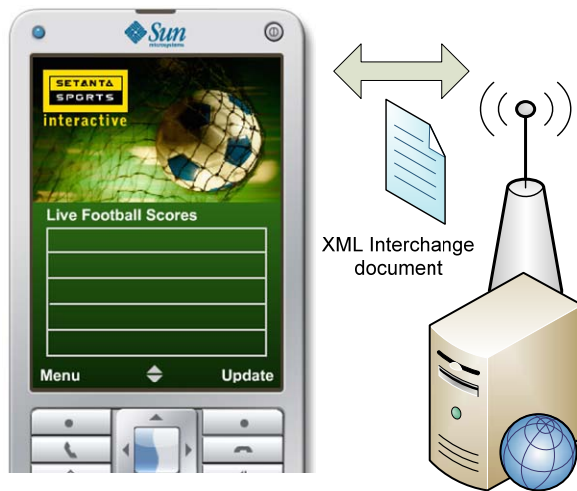
Figure 2: Mobile Interactive Service external data retrieval

As depicted in Figure 2, The Mobile Interactive Services format introduces methods of retrieving data externally to fill textual content automatically. As a result, SVGT documents can be created as templates for displaying data which is to be obtained later via an XML information exchange format. For example, the content provider could have an XML document containing sports score data. The Mobile Interactive Service can be assigned to obtain this data to use as its content when viewed. This means the content provider can just provide data and not have to create a whole new Interactive Service each time the score data changes. This significantly increases Interactive Service efficiency by considerably reducing the service development time.