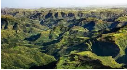
Picture 2. The Great Rift Valley in Africa