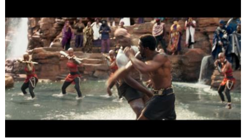
Picture 6. The fight between T'Challa and M'baku from the Jabari tribe created the Wakanda kingdom (00:26:00)

The scene when T'Challa Wakanda fought with M'baku from the Jabari tribe to win the throne to become king. This fight is true in Africa, carried out by the Suri Tribe. They fight one on one using sticks. This fight is called Donga, where two men fight using sticks without clothes, fighting until one of them surrenders, even to death.. The rules in the game are not allowed opponents to fall after falling on the ground. Through this donga ritual signifies the nature of courage and pride possessed by the in Africa, the courage shown in surrendering themselves in a fight that will even end in death, through this donga ritual we can see the courage that every man in the Suri tribe has and this ritual is also a medium to show the pride of a man that he can win the fight.