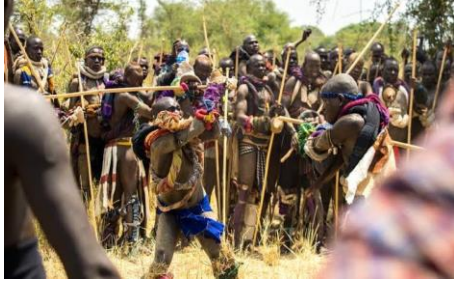
Picture 5. Donga Stick Ritual in Suri tribe