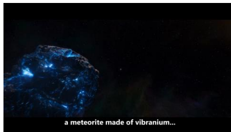
Picture 1. Vibranium in Wakanda