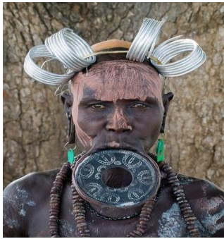
Picture 7. Woman in Mursi tribe use Lip Plate

The scene when T'Challa Wakanda fought with M'baku from the Jabari tribe to win the throne to become king. This fight is true in Africa, carried out by the Suri Tribe. They fight one on one using sticks. This fight is called Donga, where two men fight using sticks without clothes, fighting until one of them surrenders, even to death.. The rules in the game are not allowed opponents to fall after falling on the ground. Through this donga ritual signifies the nature of courage and pride possessed by the in Africa, the courage shown in surrendering themselves in a fight that will even end in death, through this donga ritual we can see the courage that every man in the Suri tribe has and this ritual is also a medium to show the pride of a man that he can win the fight.