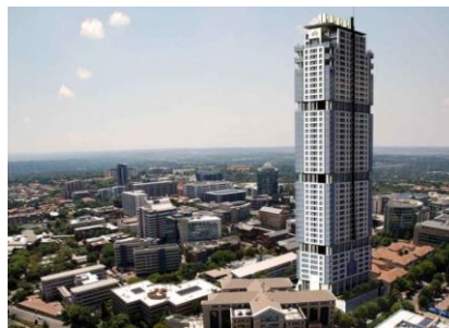
Picture 4. Leonardo, The Highest Building in Sandton, South Africa

one of example the development that occurred in Africa is Leonard, the building which became the financial center in, Johannesburg was lined to be the highest building in South Africa. A country that has tall buildings and all the ongoing economic activities in it is proof that the country is developing, and Africa has proven it with this building. Through Black Panther , Wakanda visual strongly represents the existence of Africa with towering buildings as if to show that Wakanda as an African representation also has a symbol of development.