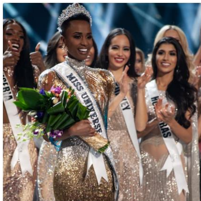
Picture 13. The depiction of intelligent African woman, Zozibini Tunzi as the winner of Miss Universe 2019

Actually, education has been carried out in Africa for a long time, since Islam was brought to West Africa by Muslim traders Berber and Tuareg. Not only limited to beliefs, Islam also forms a political, social and educational system. During the golden age of the Kingdom of Mali, mathematics, astronomy, literature, and art developed rapidly. Mali became independent as a Republican nation in 1960. Timbuktu is the one of cities in mali, was once a city of Islamic civilization. There is a famous university called Timbuktu University throughout the Islamic world. A variety of general sciences were taught, besides Islamic science, Arabic, and memorization of the Al-Quran. The media portrays that Africa has limited access to education and resources, thus creating a perspective to the public that people in Africa are lacking in education and do not have the quality of human resources to be proud of, but in fact Africans are beginning to show that they are also educated to create innovation for the country.